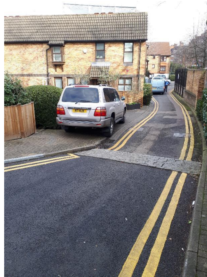
Clearly this SUV had driven straight over the newly fixed kerb area and was blocking the parking for Number 1 & 2