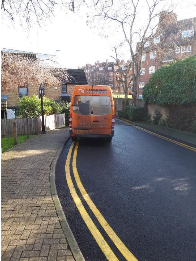
This van man was eating his lunch as we walked by