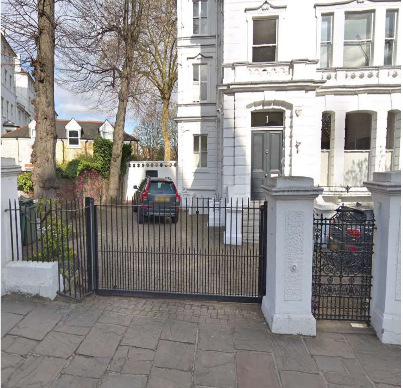
Wrought iron gates, of differing design, for both vehicular and pedestrian entrances.