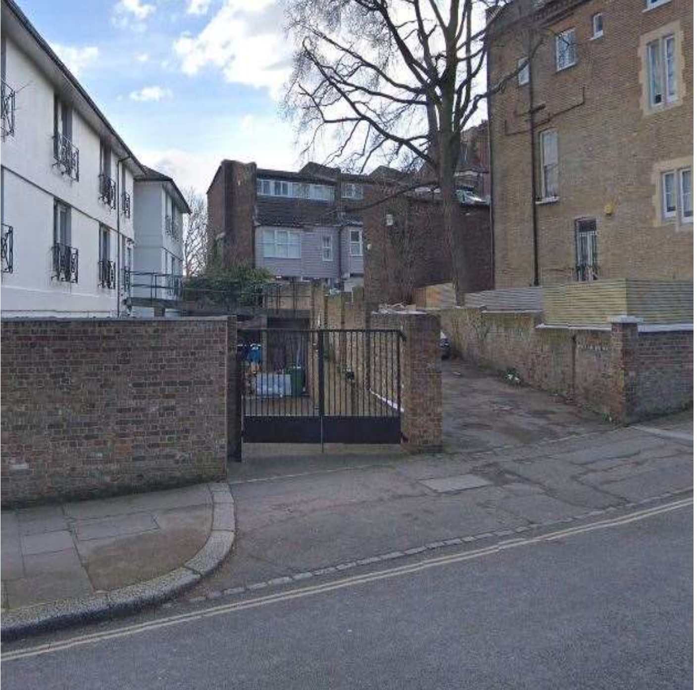
Simple metal fence with flat top rail and no finials.