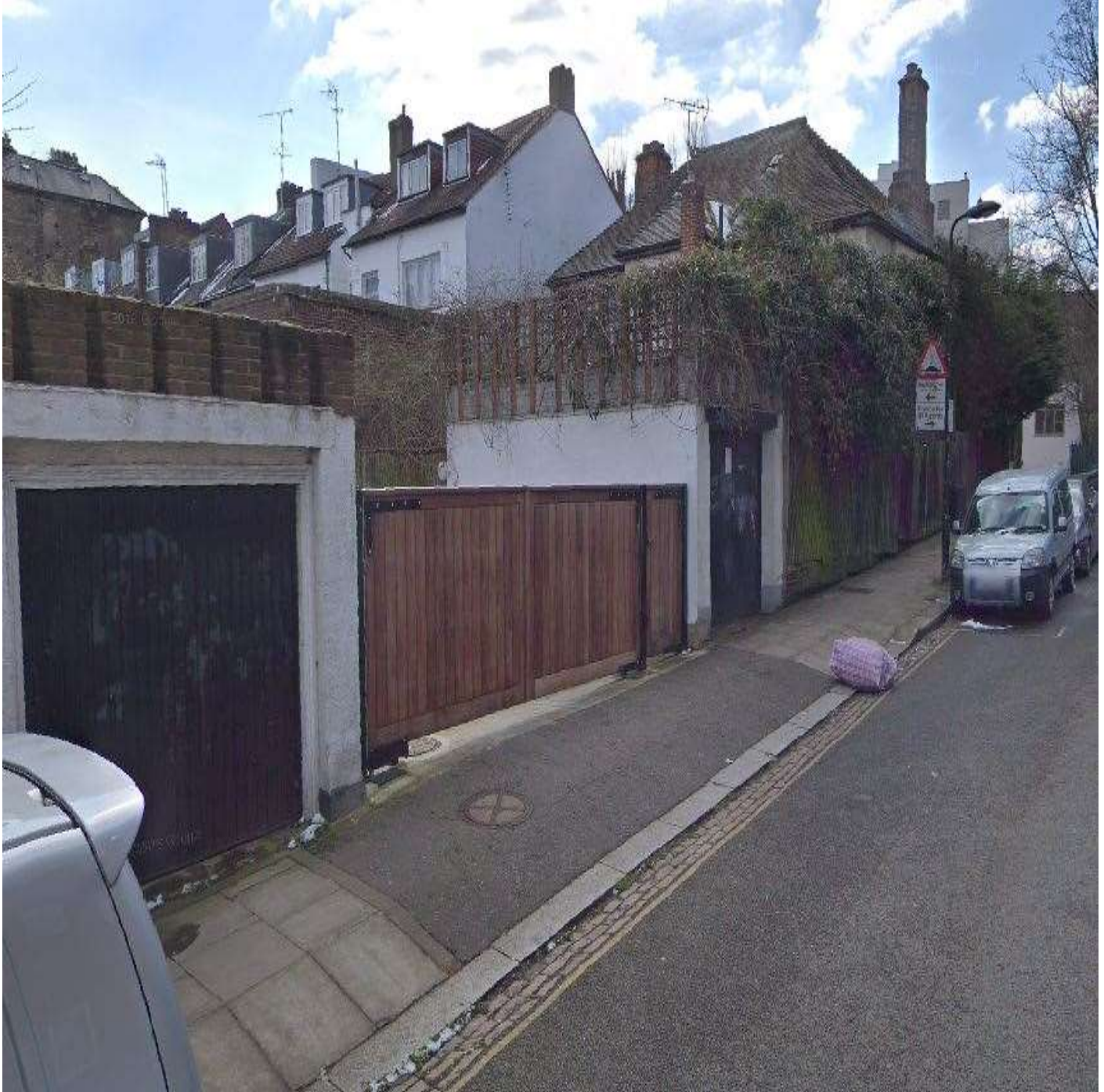
Mews off Garnet Road

Vehicular and pedestrian gates. Wooden panels block views into the Mews, contributing to an unwelcoming appearance.