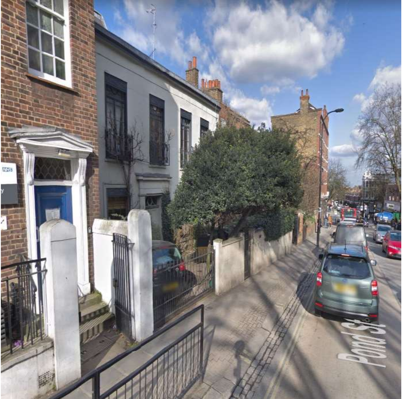
Along Pond Street

Metal gates at both the NHS building in the foreground and at houses beyond. There are also vehicular gates with spearhead finials.