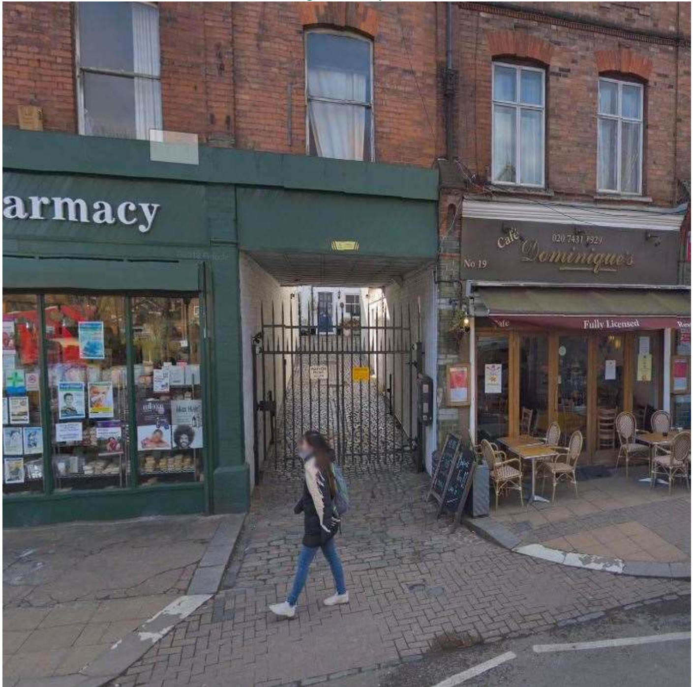
Smaller gate for Maryon Mews

Tall gates with stark finials, reinforced arms, locks and warning signs. They not only present an unwelcoming appearance, but also fill out most of the entryway's space up to the roof overhead.