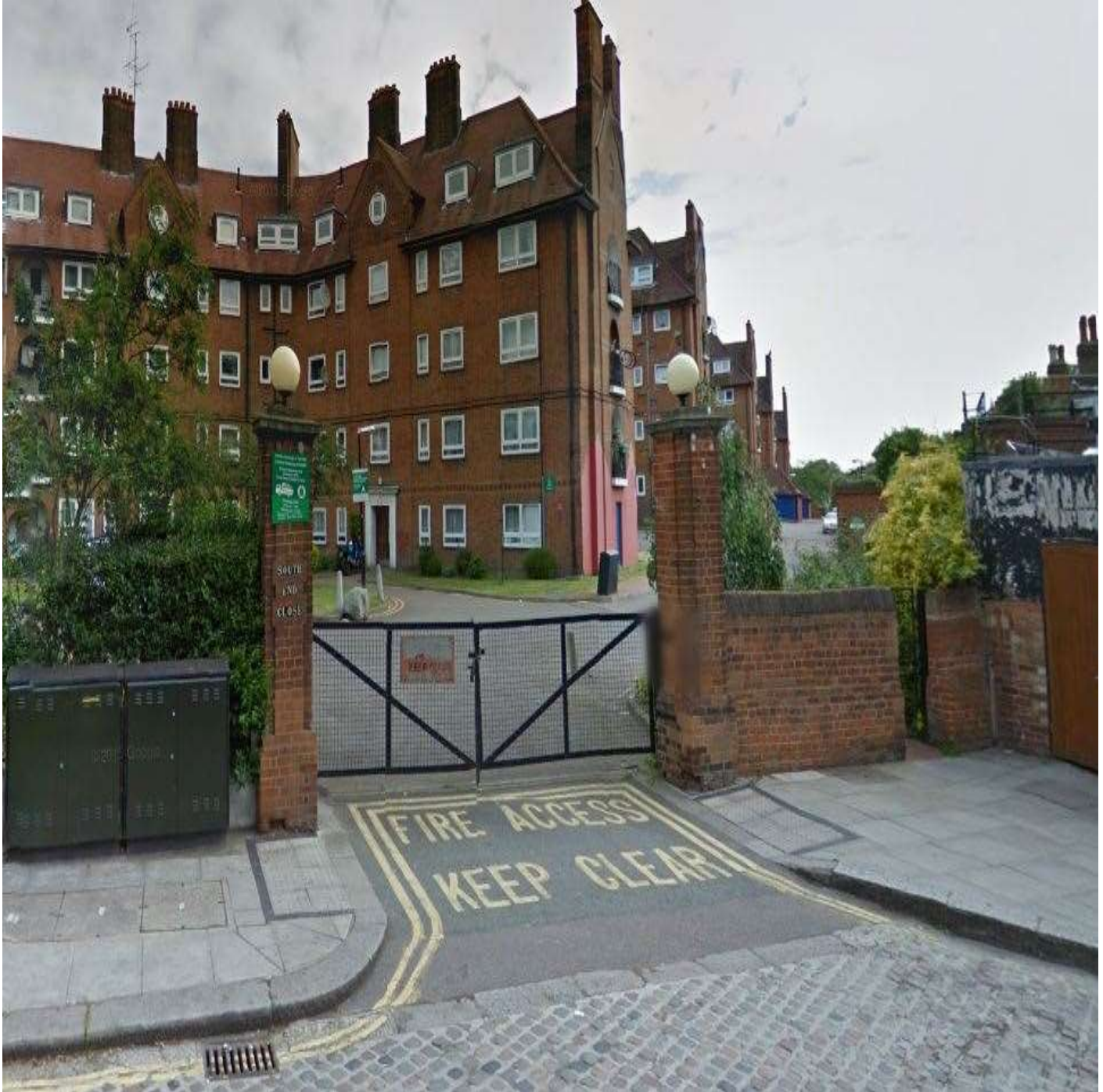
South End Close

Vehicular gates with pedestrian gate to the right. Warning signs are seen on the vehicular gate. The green sign indicates that it is a Council-managed property.