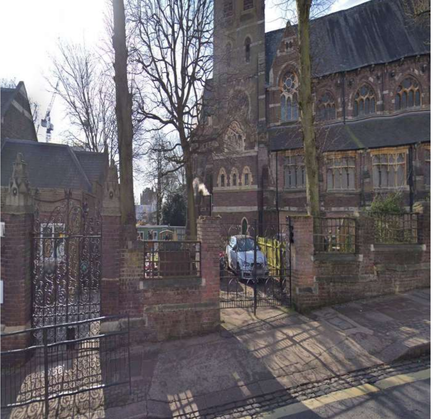
Church and School at Pond Street

Elaborate wrought iron gates for both pedestrian and vehicular entrances.