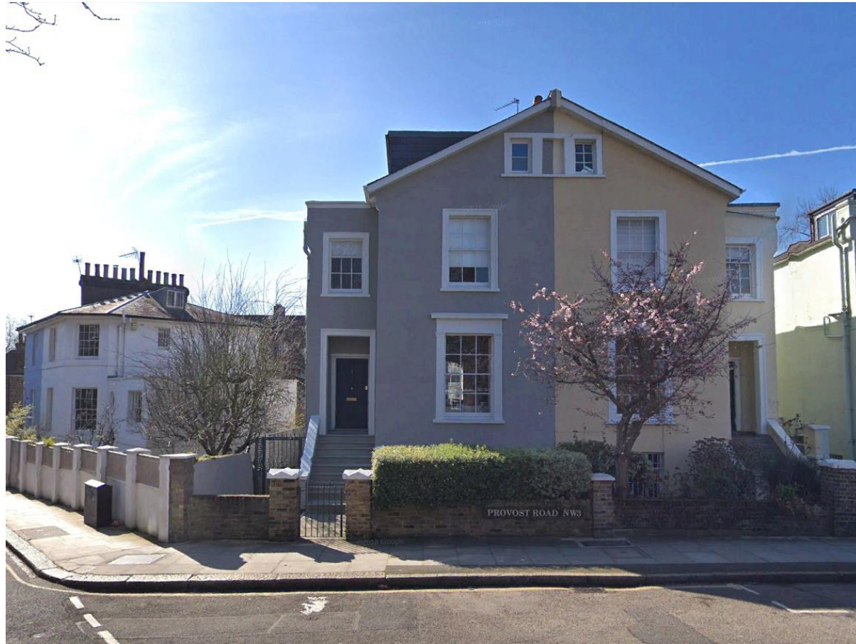
1 Provost Road NW3 4ST Design & Access Statement April 2019