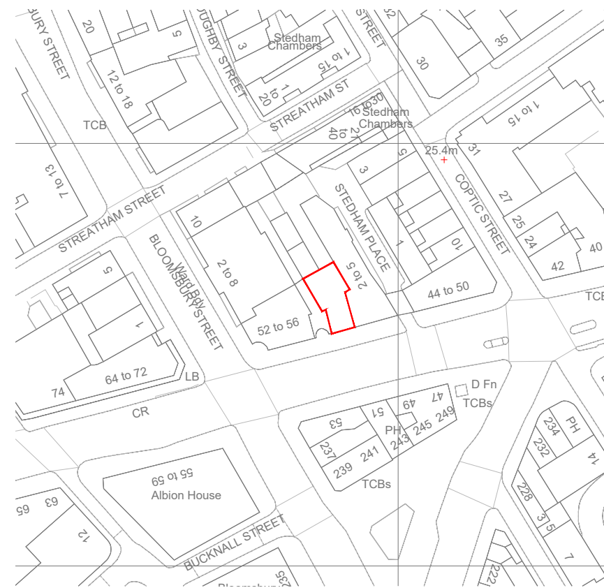
Location Plan - 1:1250