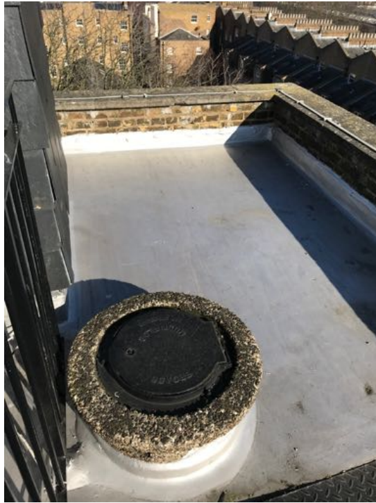
Figure 3: The proposed location of the units, set down behind the brick parapet