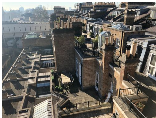
Figure 2: Rear elevation of 1-9 Cambridge Gate (2019)