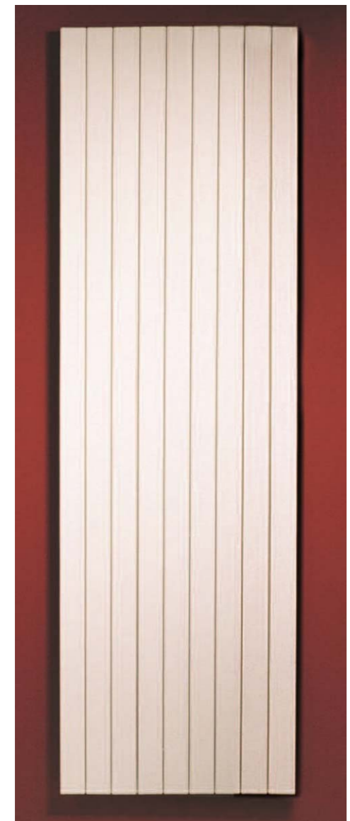
PROPOSED RADIATOR MHS RADIATORS VIOLA VERTICAL

PROGRAMMABLE THERMOSTAT ON WALL IN LOUNGE