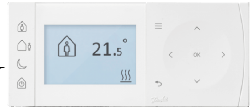
PROPOSED PROGRAMMABLE THERMOSTAT

PROGRAMMABLE THERMOSTAT ON WALL IN LOUNGE