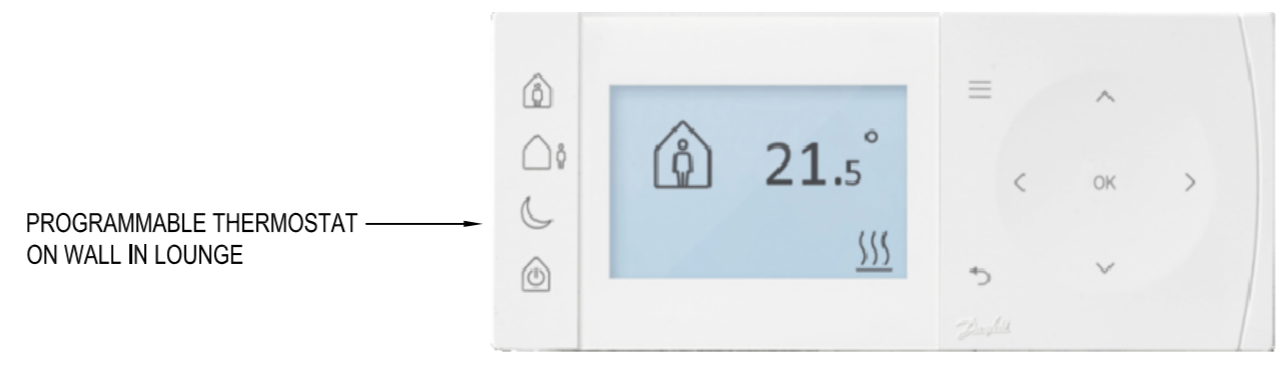
PROGRAMMABLE THERMOSTAT ON WALL IN LOUNGE