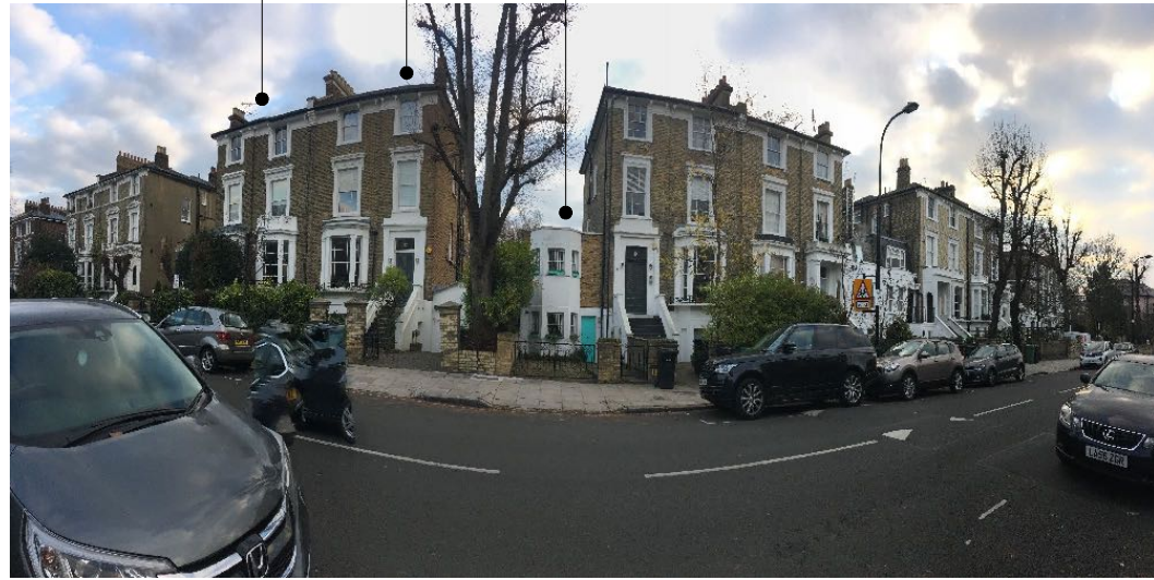
View A - Even number houses including 12 on Parkhill Road

14 Parkhill Road 12 Parkhill Road 10a's 2-storey extension next door to 12 Parkhill Road