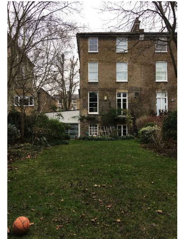
View C - Garden and rear elevation of main house and existing extension of 12 Parkhill Road