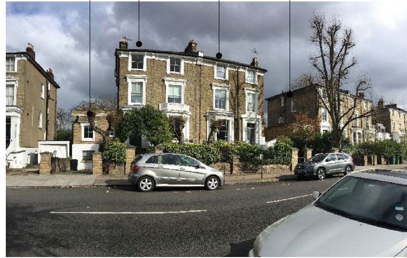
View B - 14, 12 and 10 Parkhill Road

2-storey extension 14 Parkhill Road 12 Parkhill Road 10 and 10a Parkhill Road