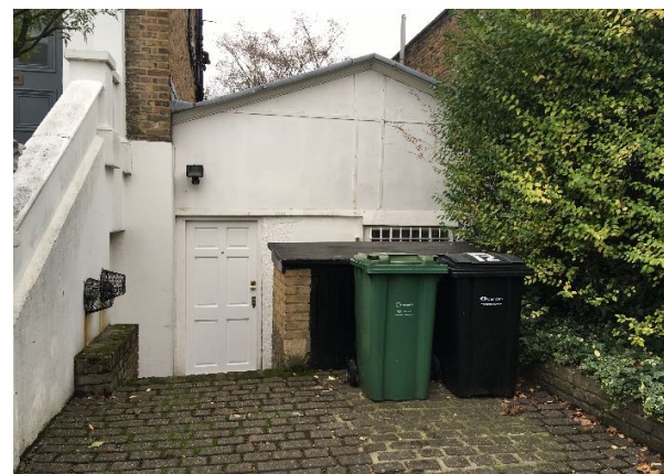
Existing extension from drive with dilapidated and unsuitable bin store