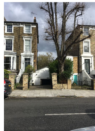
12 Parkhill Road showing existing extension view from street