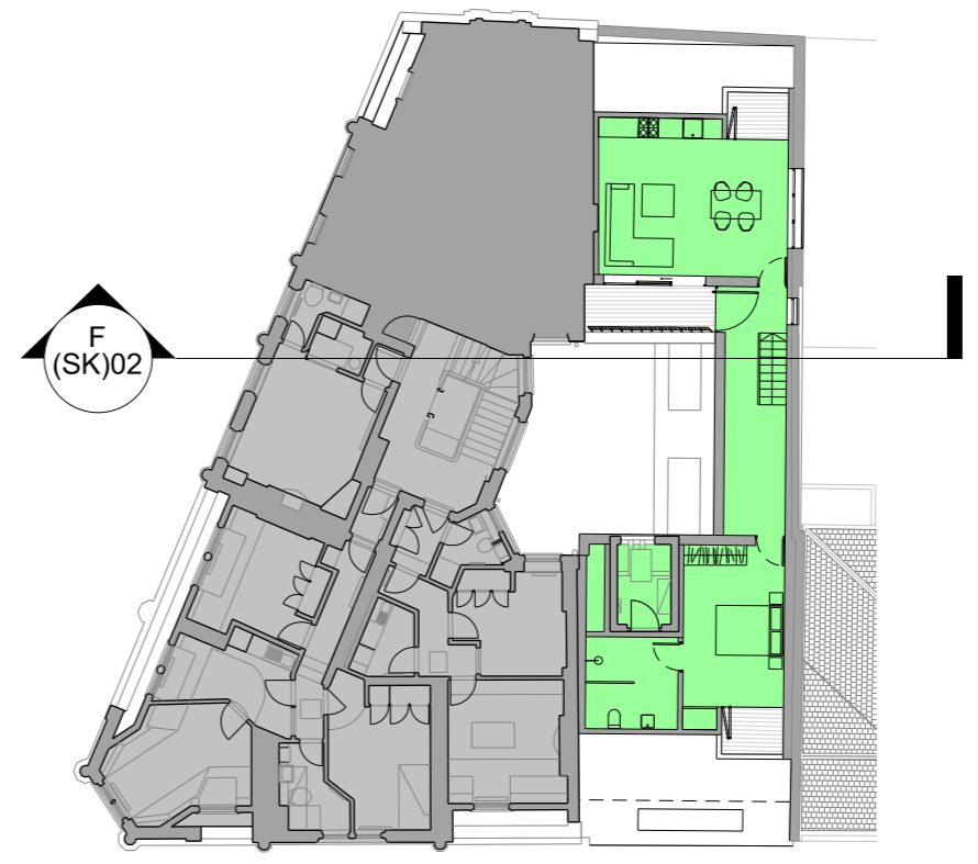
2 Fifth floor plan 1.250 (SK)02