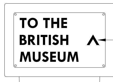
(S2) FIXED TO END OF PLANTER

0.55mm ENGRAVED TEXT TO HAVE WHITE INFILL TO BE LOCATED AS SHOWN, EQUIDISTANTLY TO EACH RESPECTIVE EDGE.