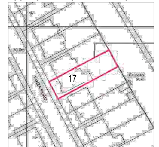
LOCATION PLAN OF 17 TANZA ROAD