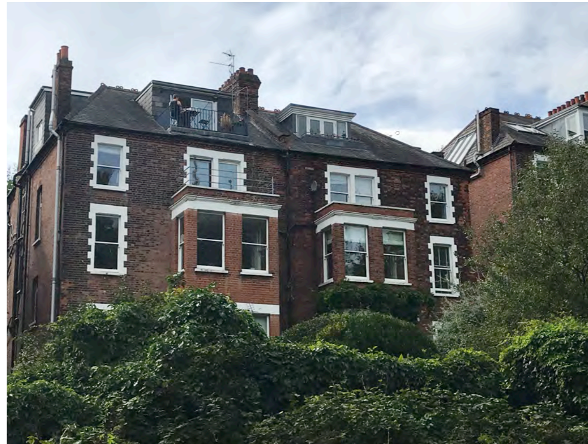
17 Tanza Road (Left) from the rear, with 19 Tanza Road (Right)