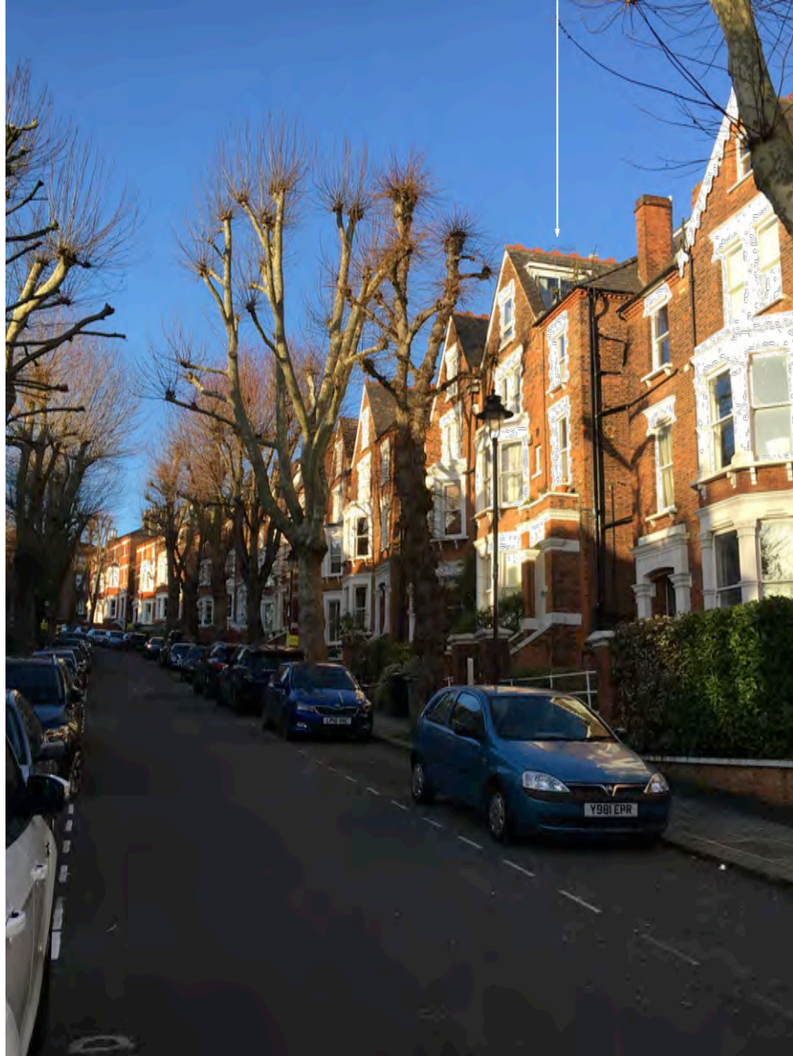
Context view looking up Tanza Road