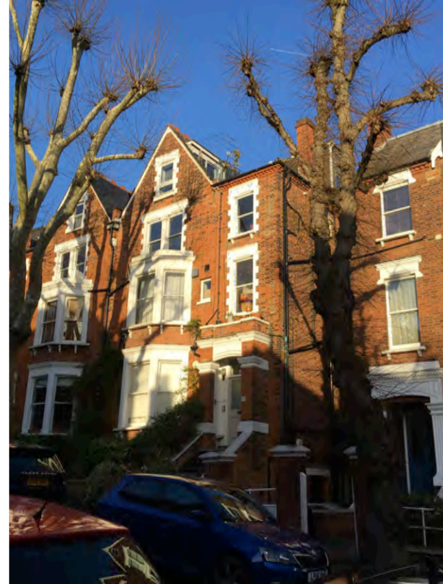
17 Tanza Road