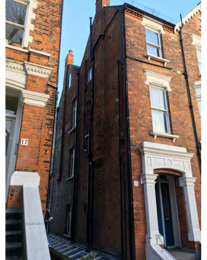
Flank wall to 15 Tanza Road, showing discreet appearance of additional windows at upper levels