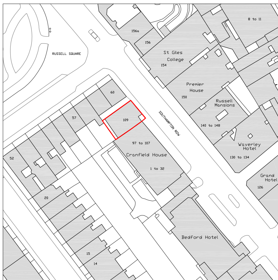
01 LOCATION PLAN Scale 1:1250

N.B. site boundary to be confirmed by Clarion Housing Group