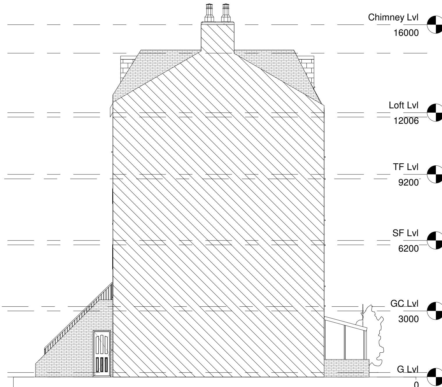
LH Elevation 1 : 100