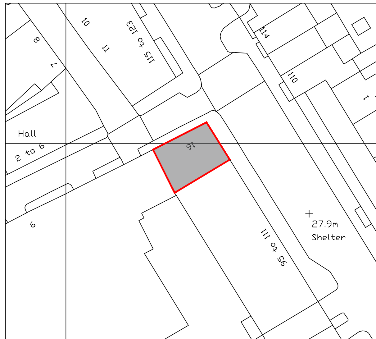
site plan scale 1:500 @ A3

red line indicates extent of application site