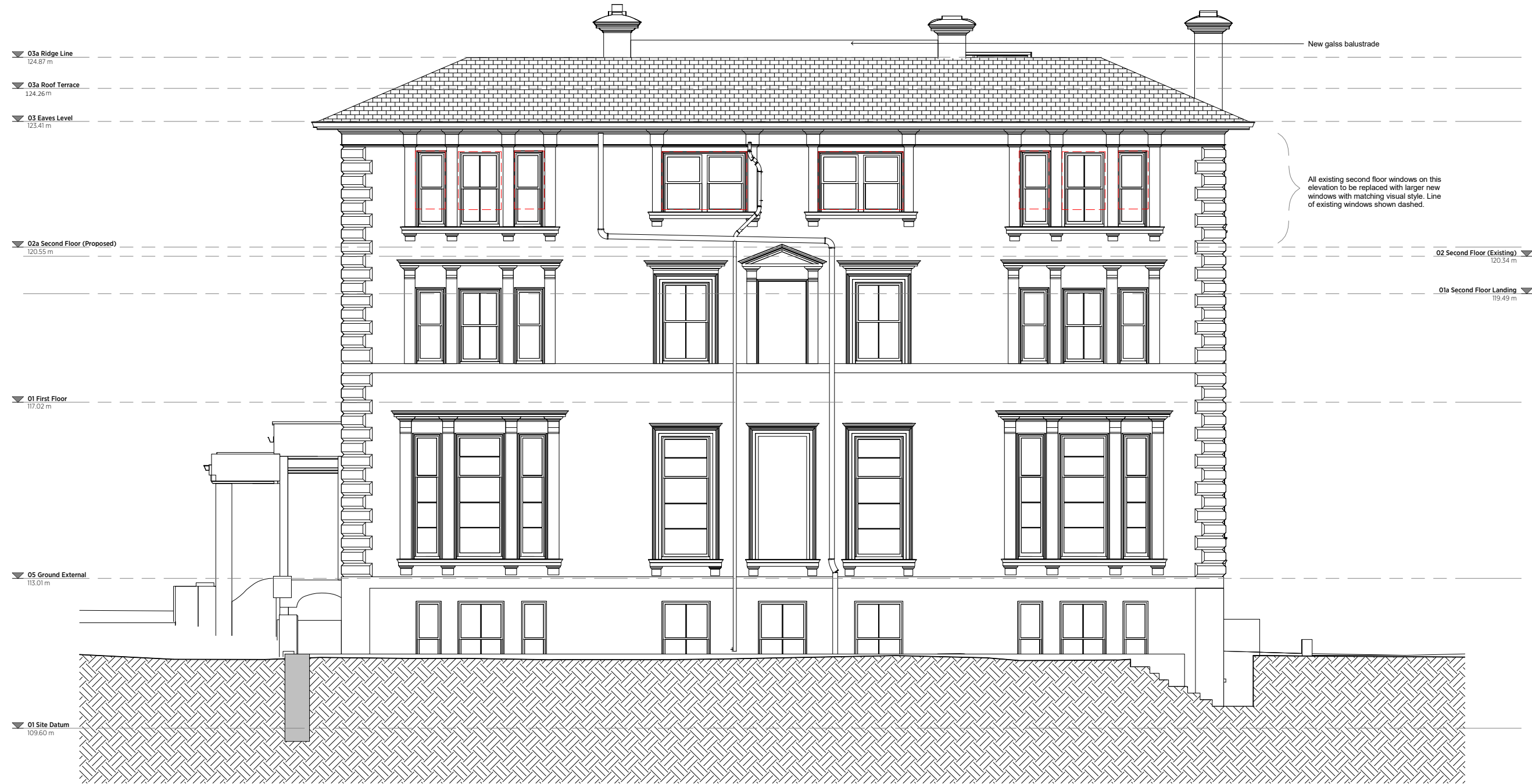
1 Proposed Elevation 3 1:50

GENERAL NOTES: This drawing is copyright of KSR architects. This drawing must be read in conjunction with the Designer's Risk Assessment, specification and all other relevant documentation and drawings. KSR architects accept no liability for any expense, loss or damage of whatsoever nature and however arising from any variation made to this drawing or in the execution of the work to which it relates which has not been referred to them and their approval obtained. Areas are based on unchecked survey and are approximate only. Do not scale from this drawing or the digital data, only figured dimensions are to be used. Refer to linear scale for guidance. Check all dimensions on site prior to carrying out any works and advise any discrepancy.