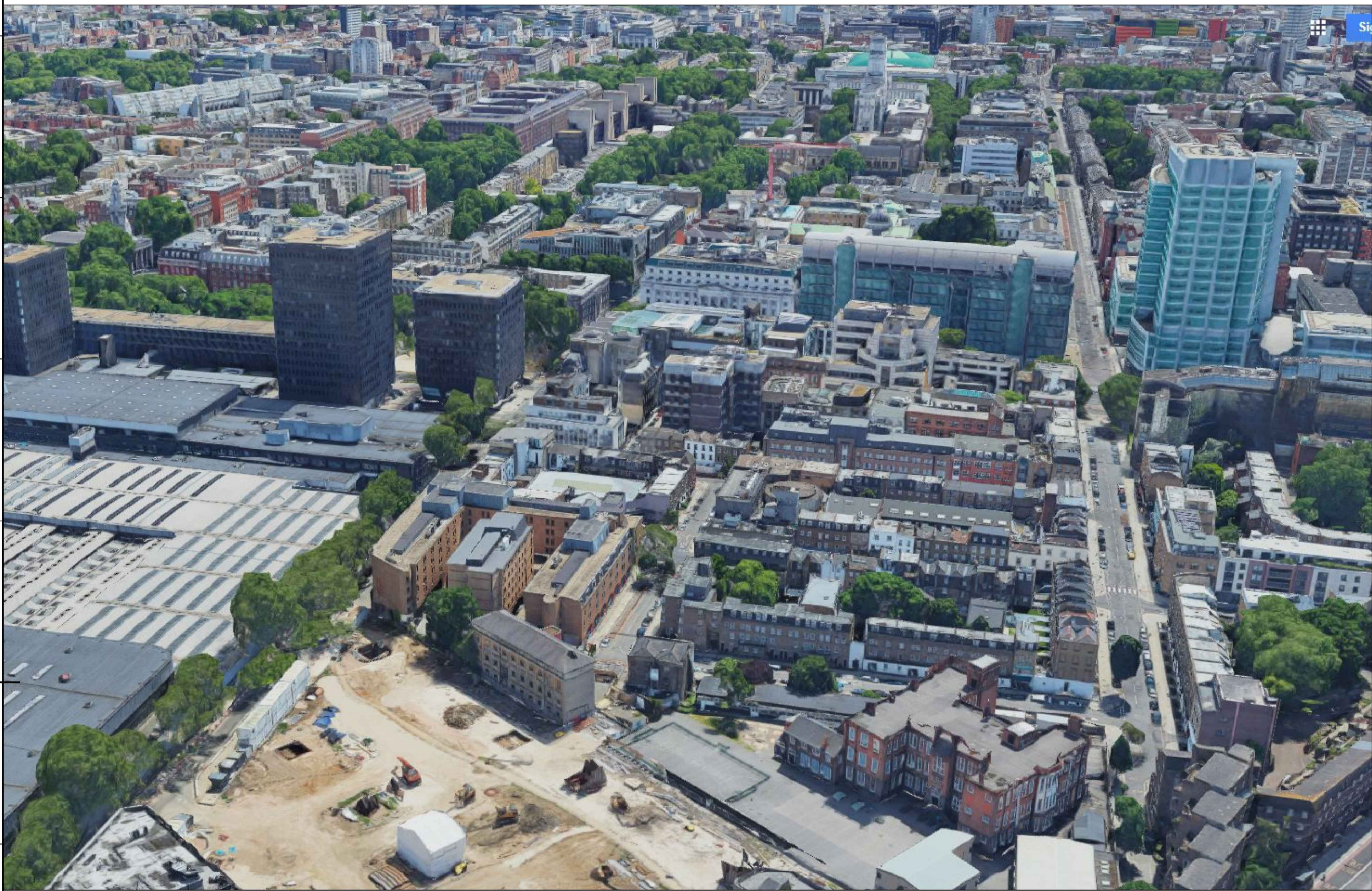
1 EXISTING VIEW