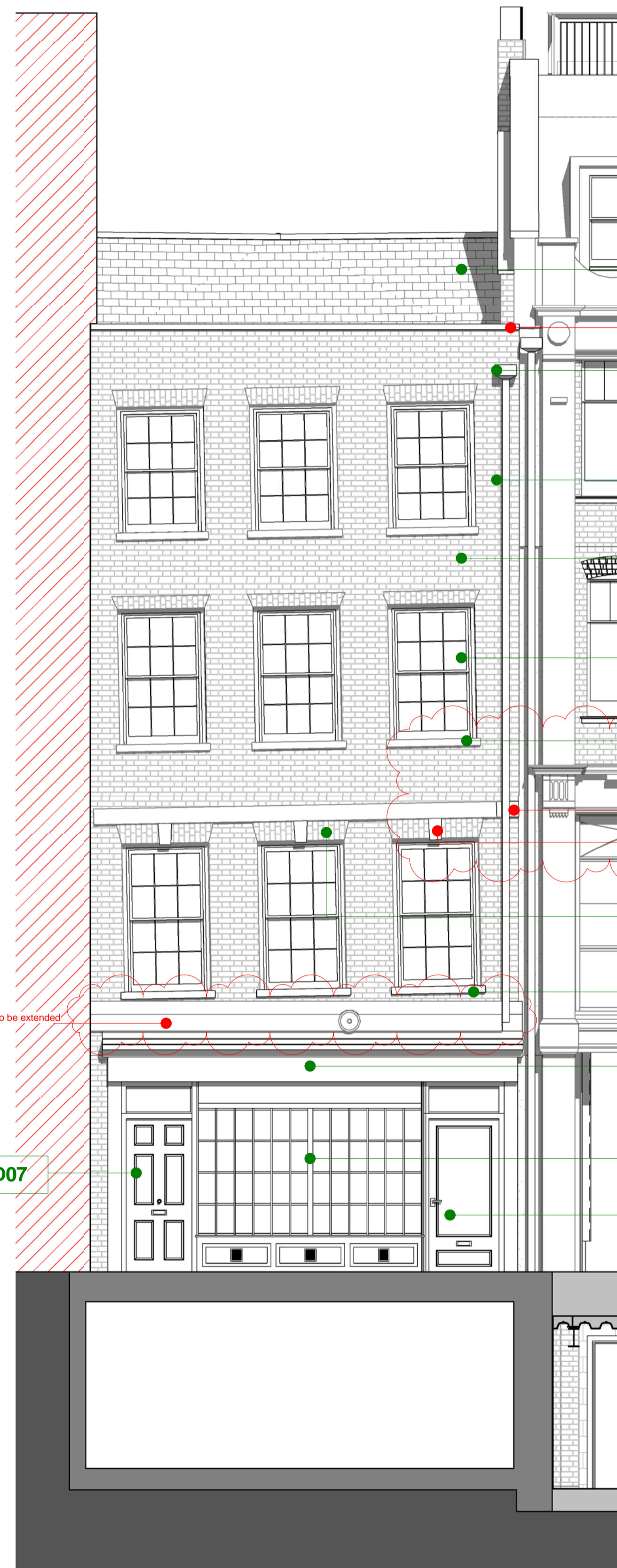
1 No. 20 Denmark Street Proposed South (south-east) Elevation Scale: 1 : 50