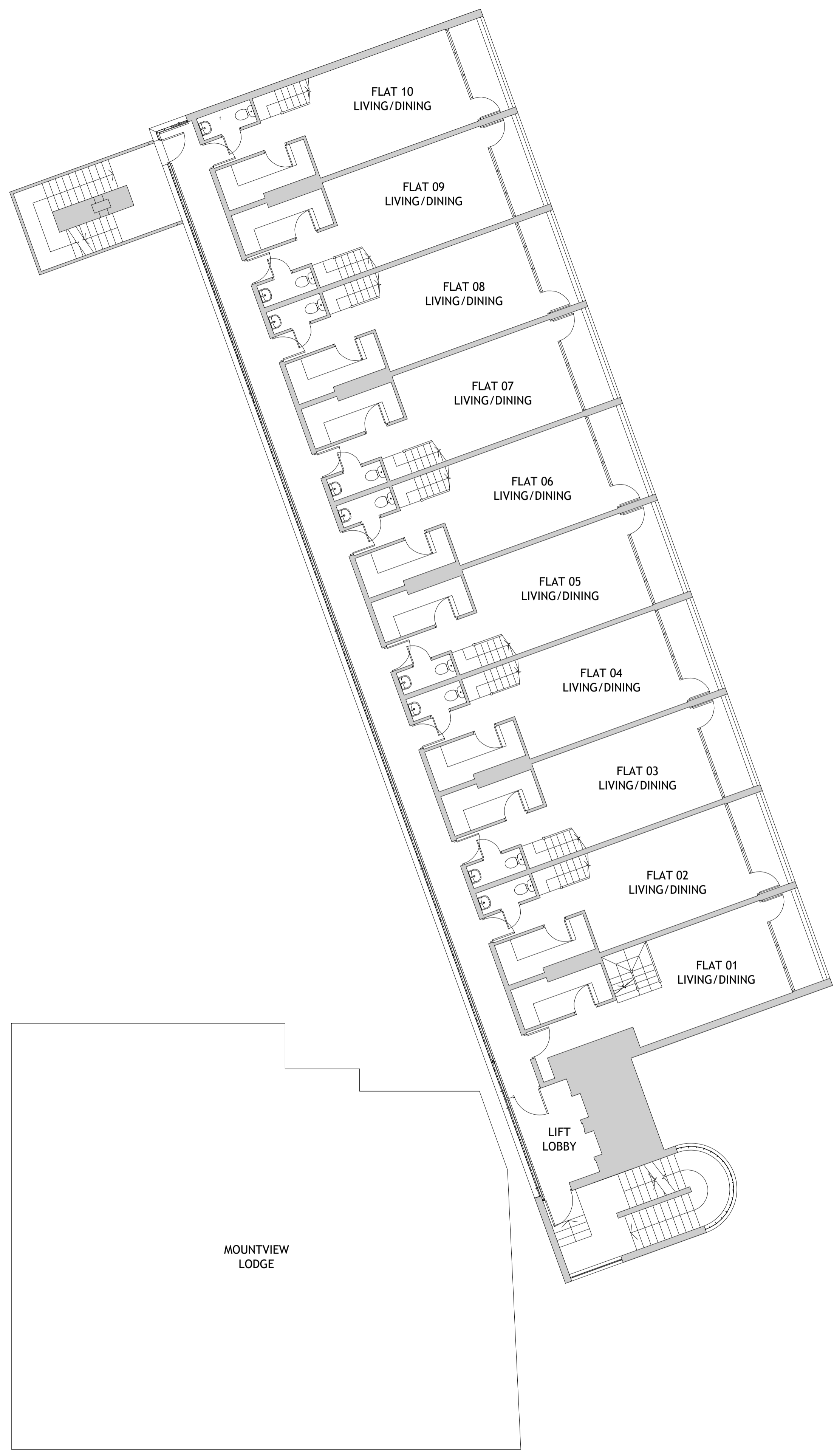
CENTRE HEIGHTS SIXTH FLOOR PLAN SCALE 1:100