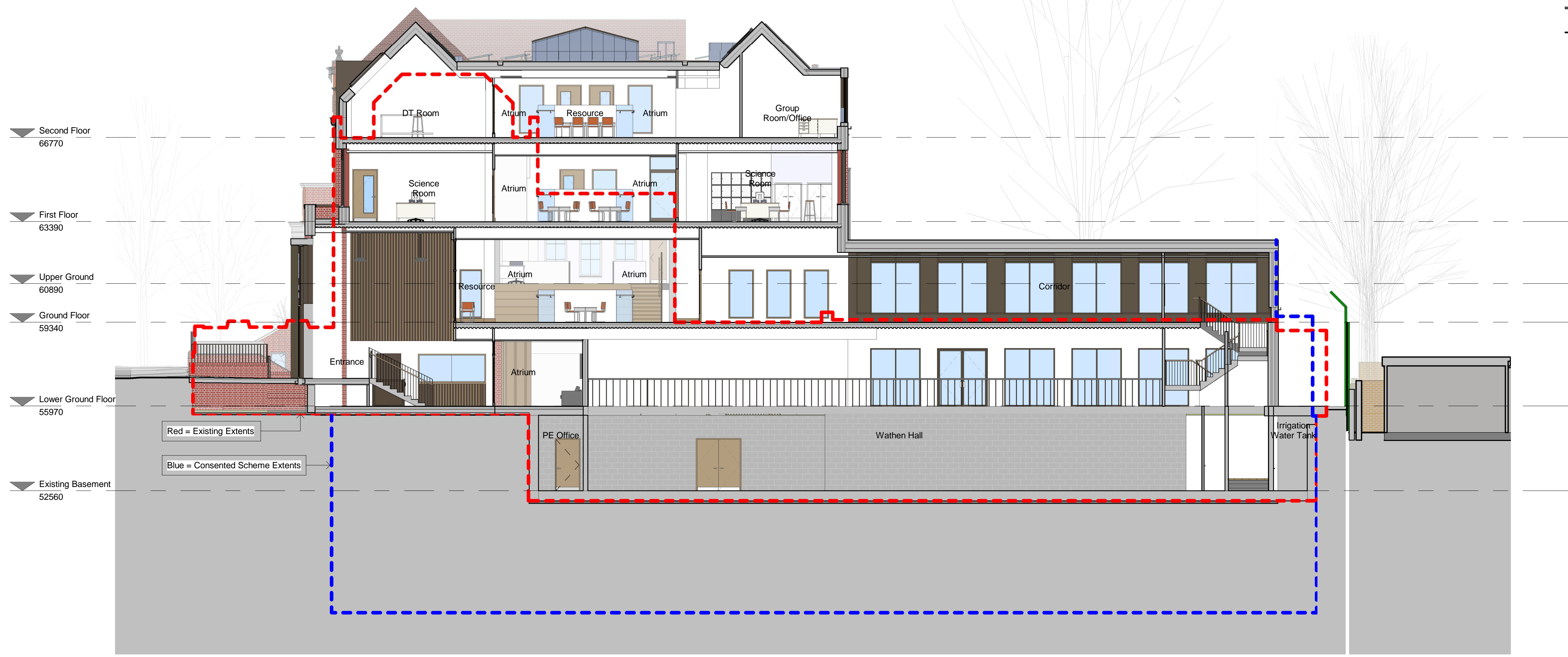
Proposed Section E 1 : 100