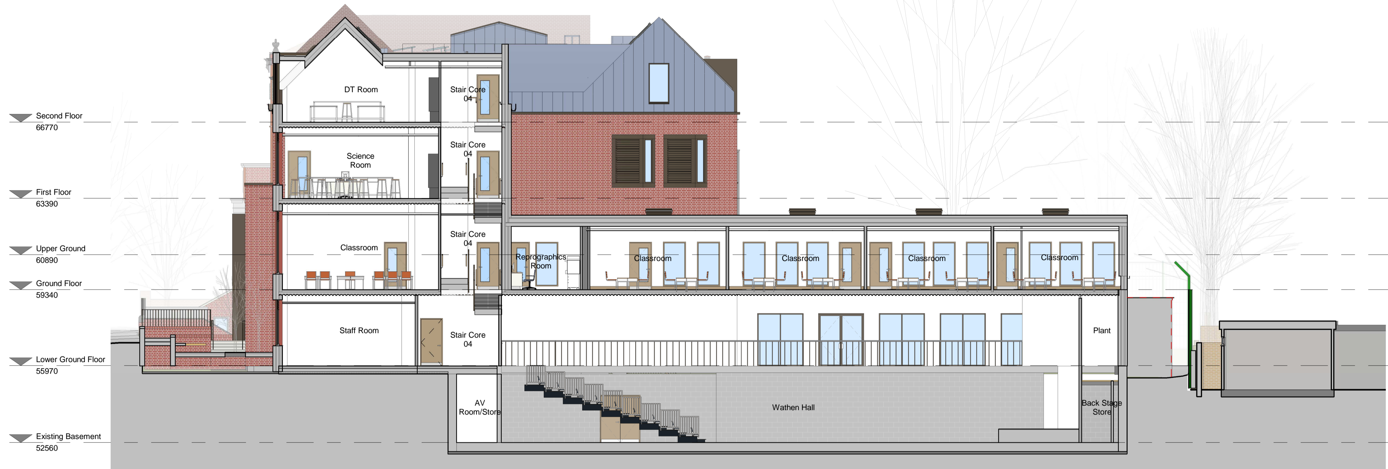
Proposed Section B 1 : 100