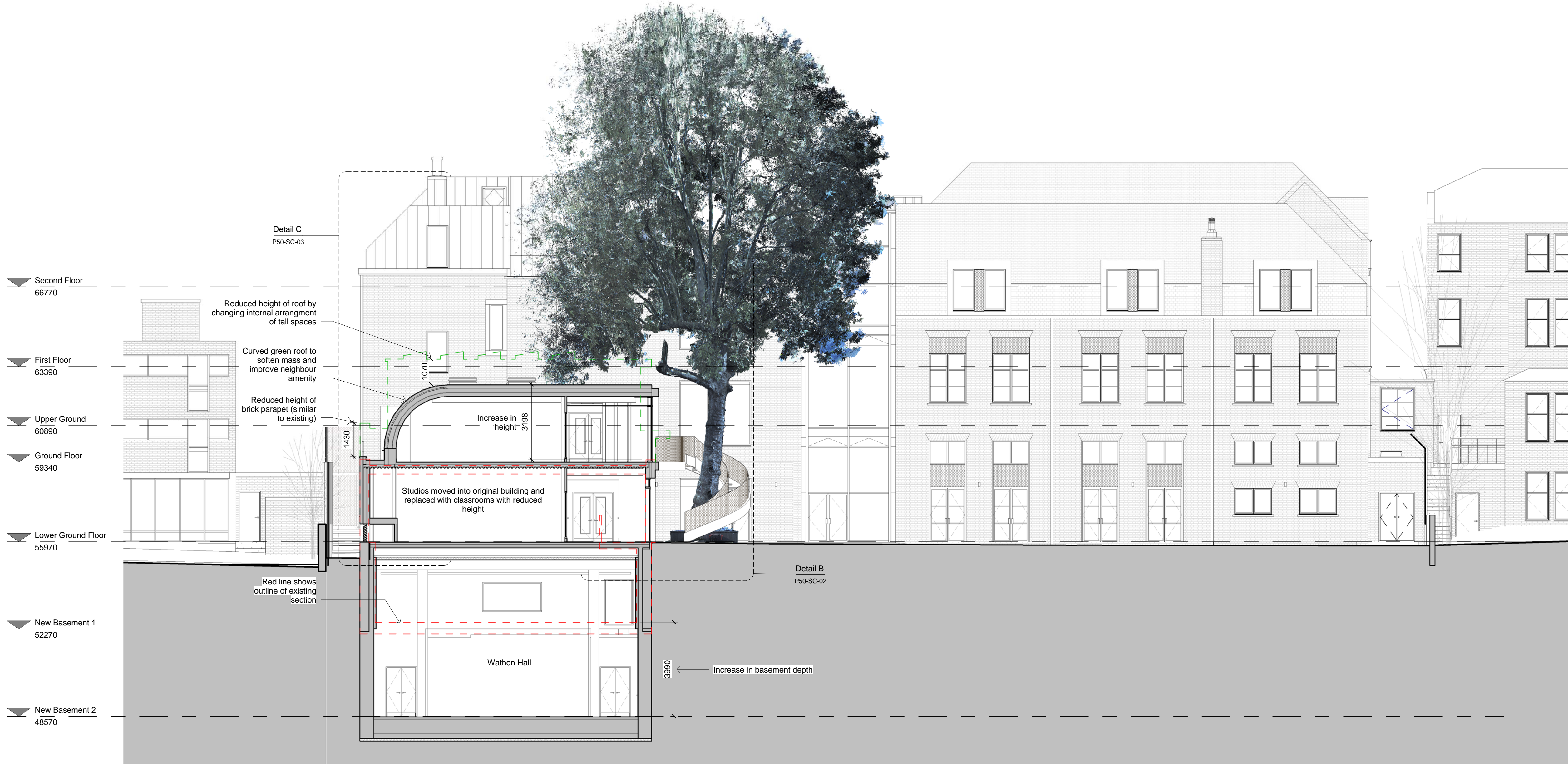
Proposed Section A 1 : 100