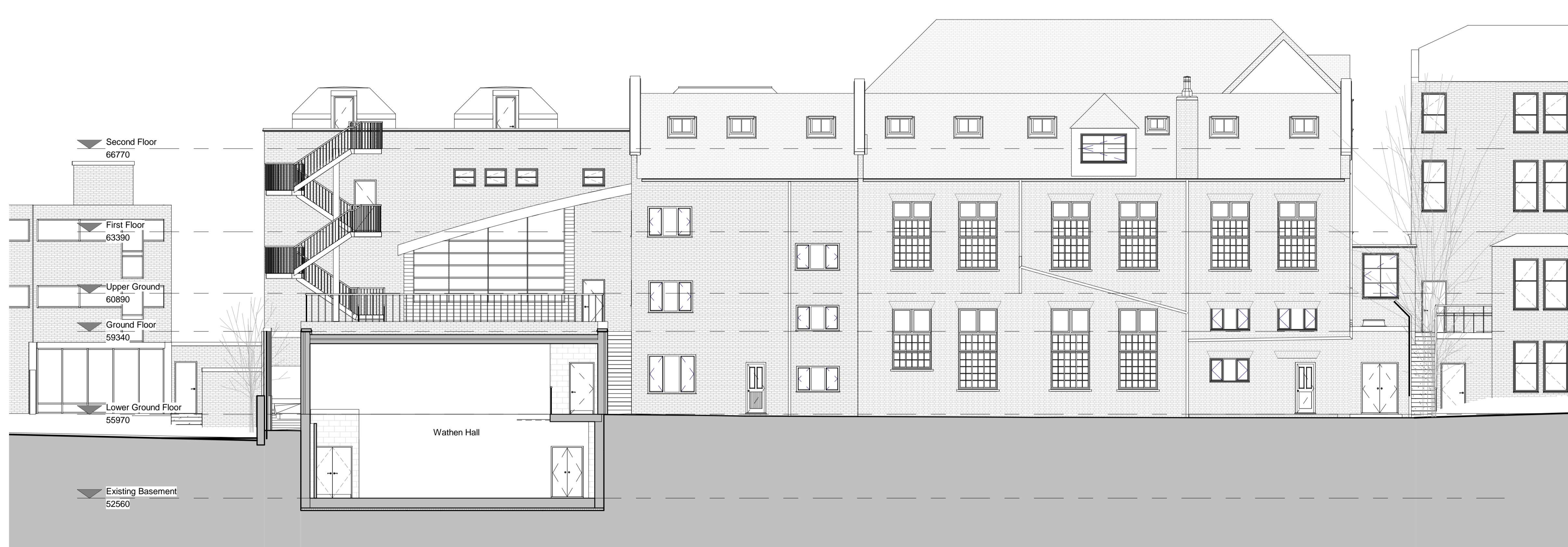
Existing Section A 1 : 100