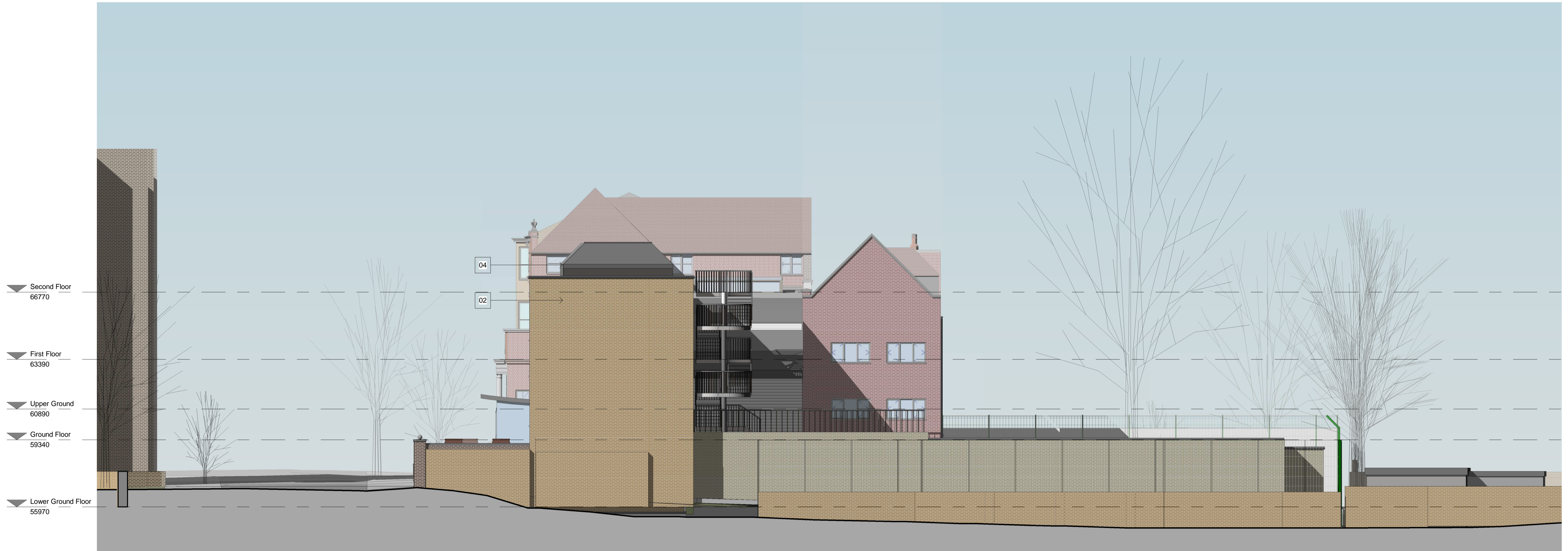
EX South Elevation 1 : 100