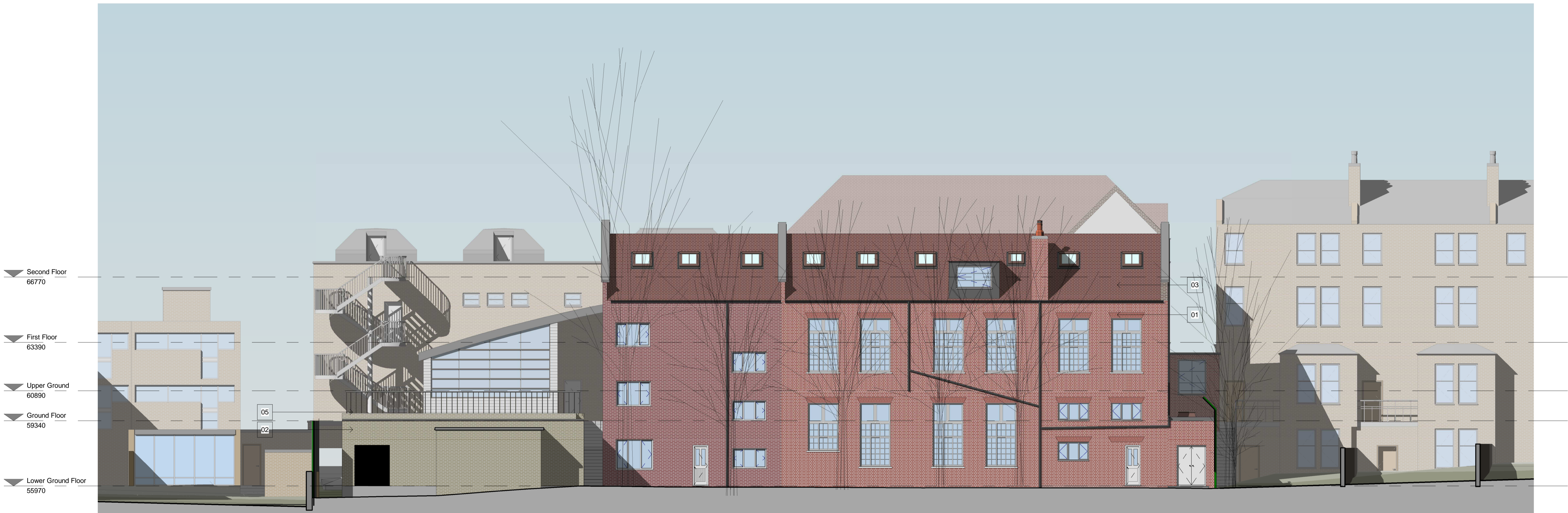
EX East Elevation (Rear) 1 : 100