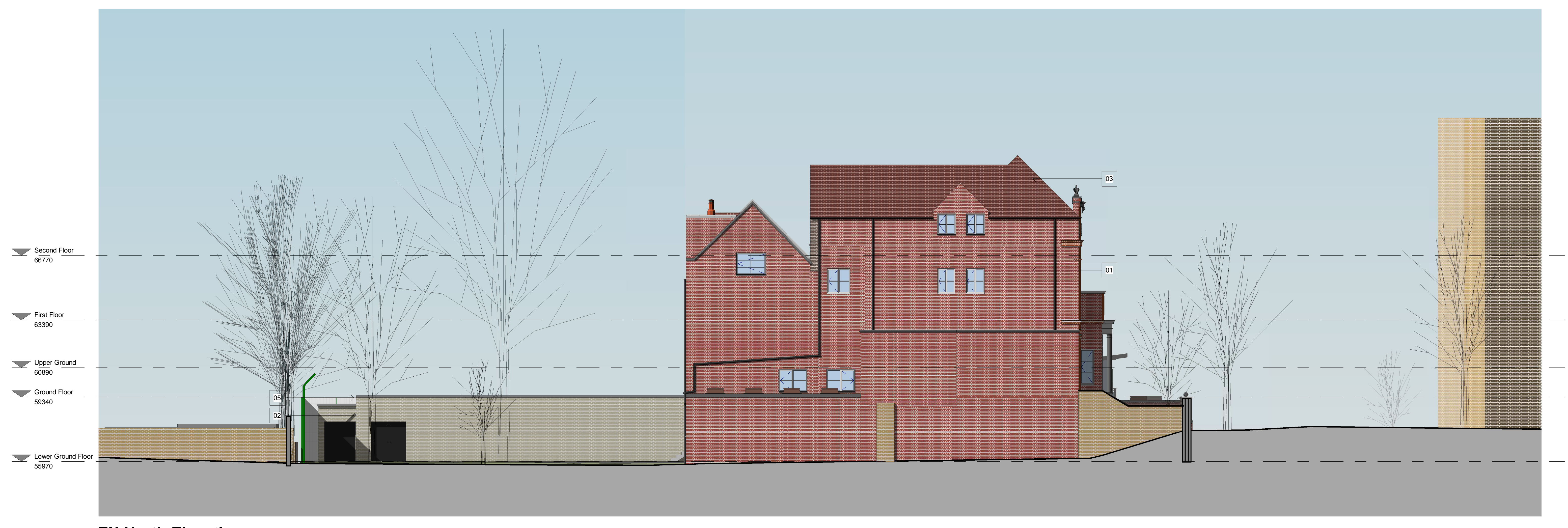
EX North Elevation