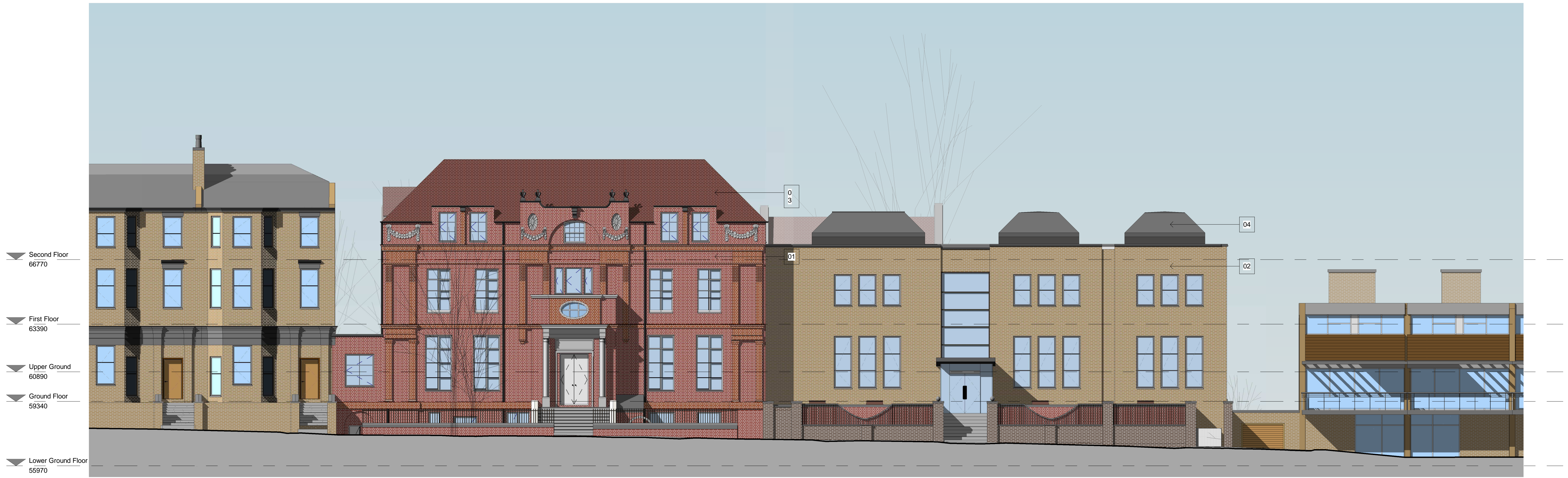
EX West Elevation (Front) 1 : 100