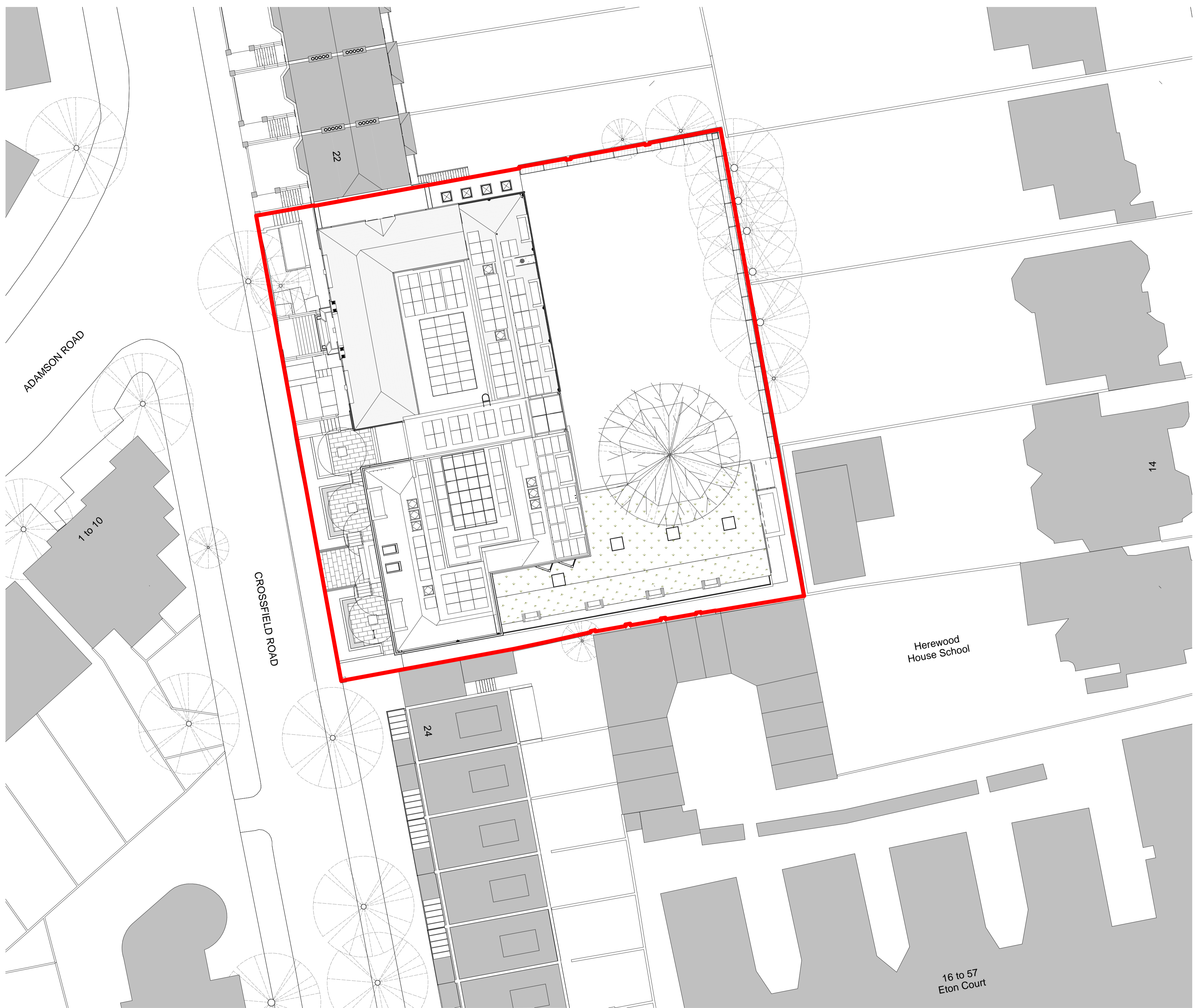
Proposed Planning Site Plan 1 : 200

Project/Client: The Hall Senior School Hampstead London Project No: IALN14-0046 Dwg No: P10-00-02 Rev: B Scale: As indicated @A1 Drawing: Proposed Site Plan Drawn By: CB Date: 04.11.16 Checked By: KS Date: 04.11.16