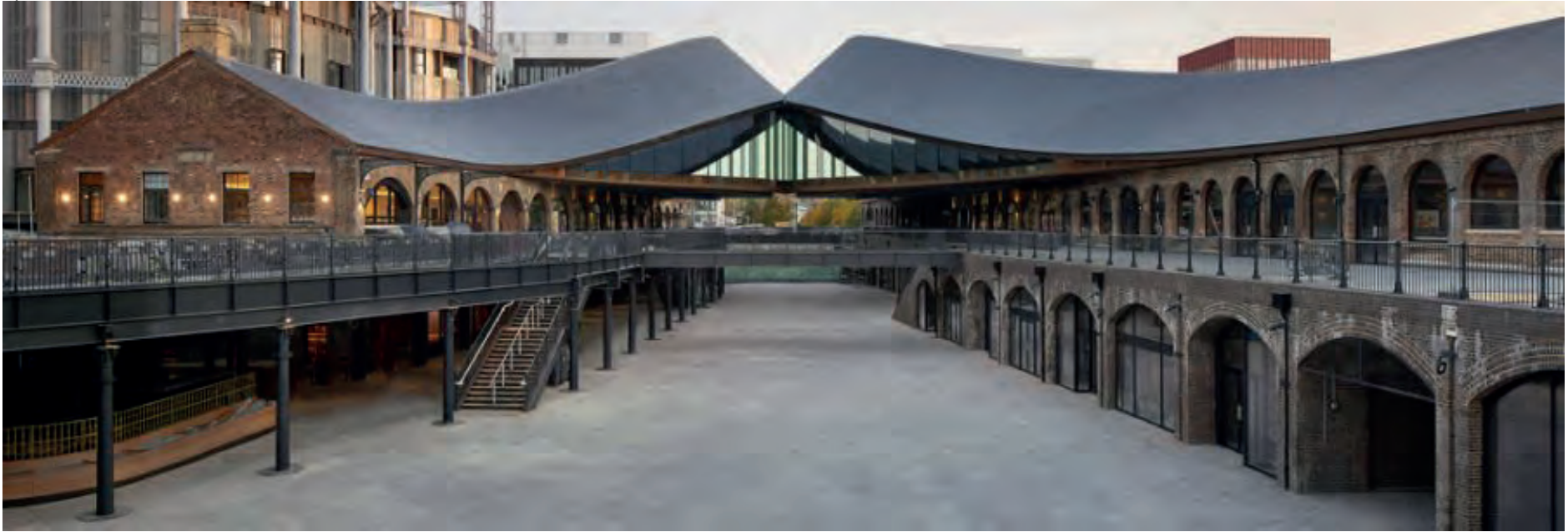
Figure 16 (opposite): Coal Drops Yard in 1990 Figure 17 (above): Coal Drops Yard in 2018