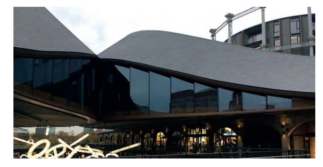
Figure 16 (opposite): The west elevation of the ECD from the Western Coal Drops viaduct Figure 17 (above): The new extension by Heatherwick Studio

Having reviewed the signage proposals and their locations on different parts of the site, we consider that the proposals will not cause harm to the significance of the listed building or the surrounding Conservation Area.