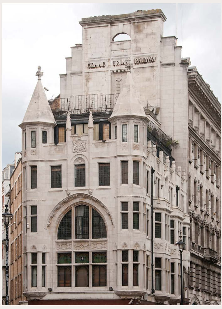
Before restoration work