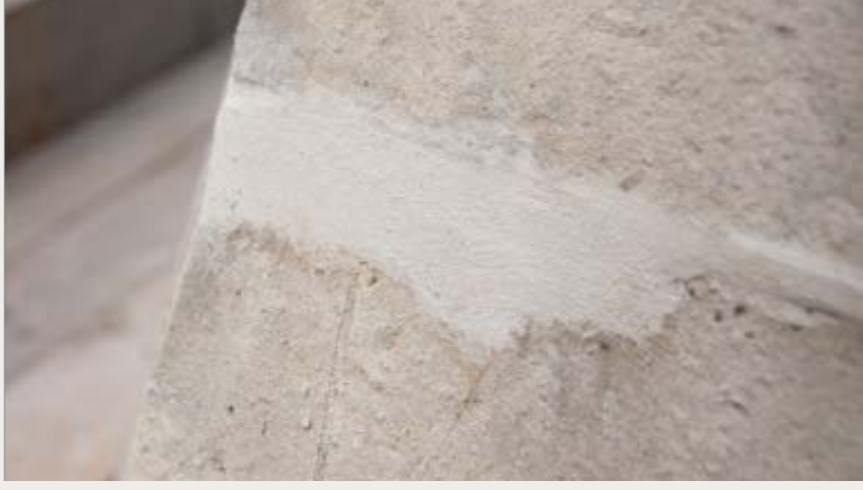
Pinning and re-pointing the Portland stone.