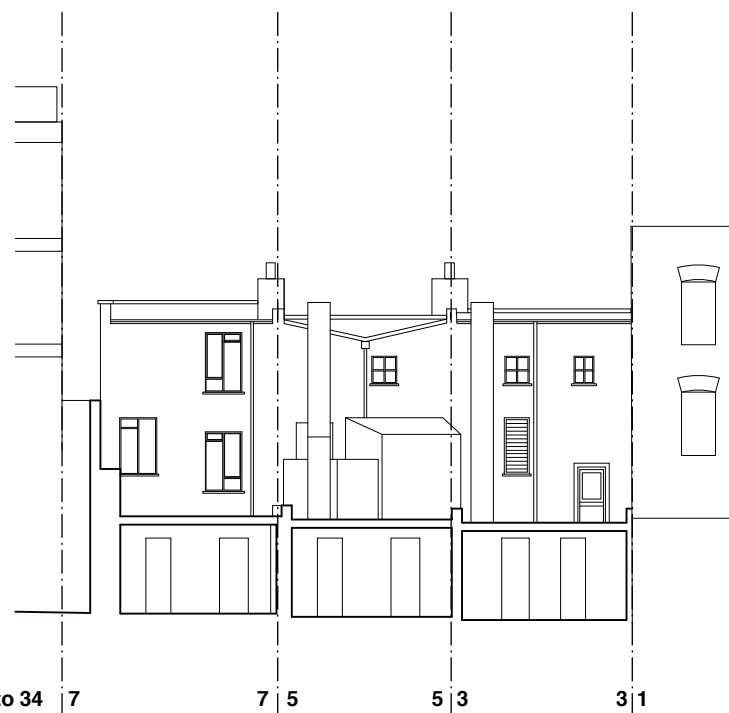
Existing Rear Sectional Elevation B Scale 1:100

ONLY STATUS 'C' DRAWINGS TO BE USED FOR CONSTRUCTION PURPOSES