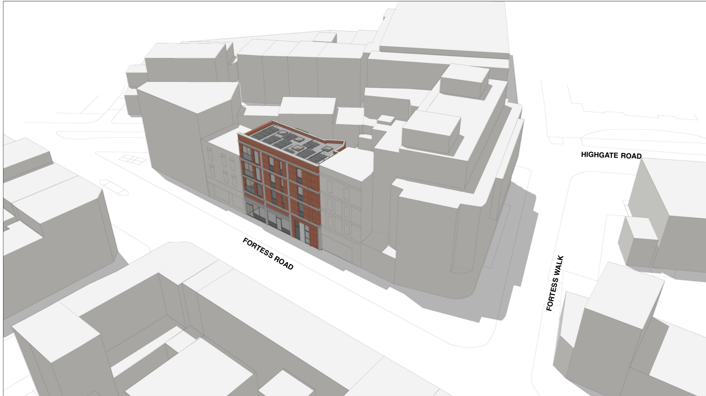
PROPOSED 3D MASSING VIEW 2 - FRONT