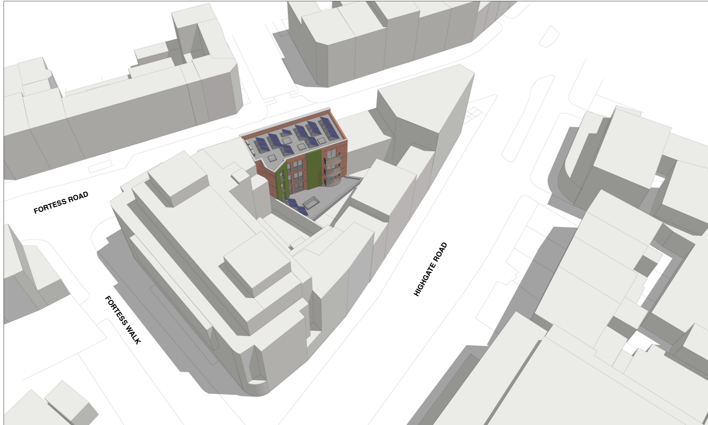
PROPOSED 3D MASSING VIEW 3 - REAR