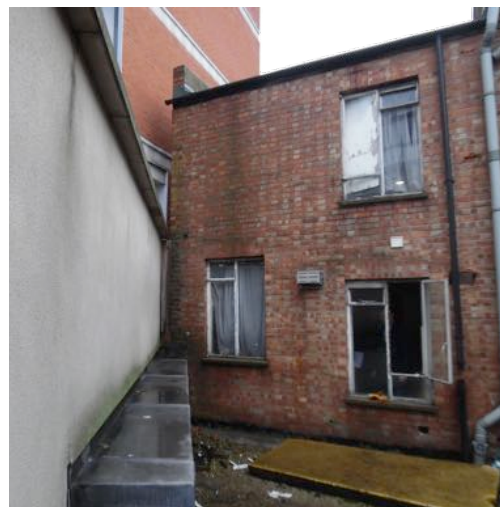
PH4 - REAR VIEW OF No 7