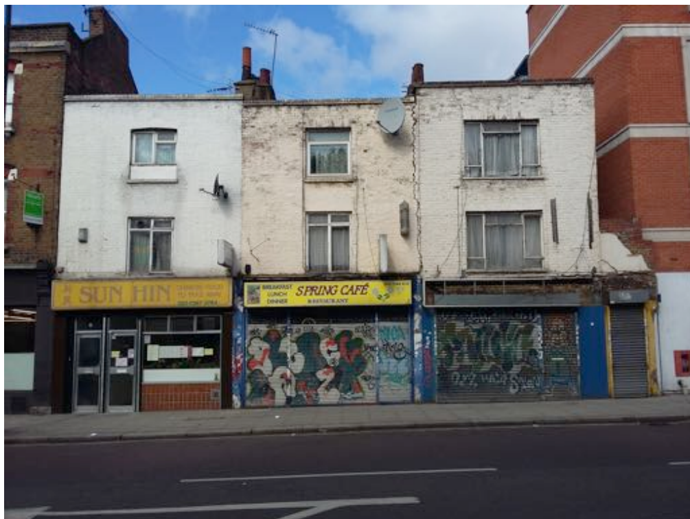
PH3 - FRONT VIEW OF NUMBERS 7, 5 & 3