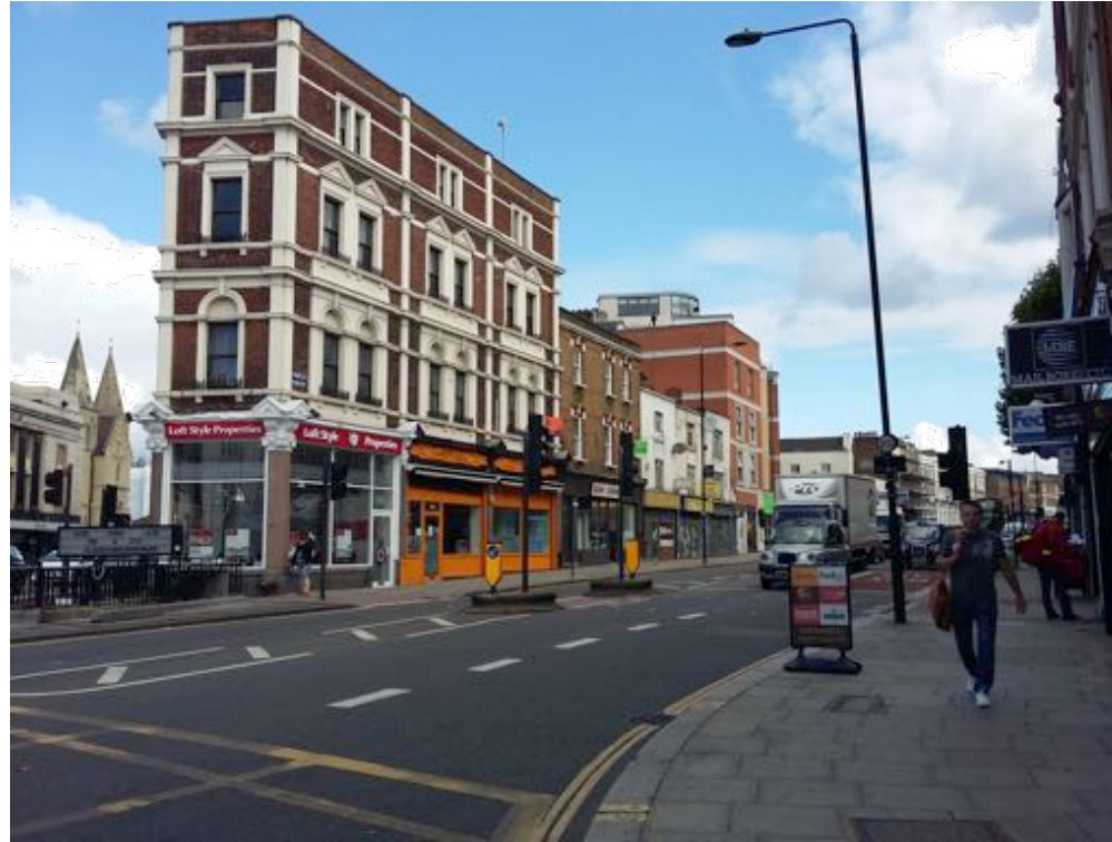
PH2 - SIDE VIEW OF NUMBERS 2, 1, 1a, 3, 5, 7 & 9