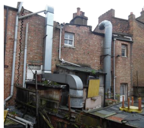
PH5 - REAR VIEW OF NUMBERS 7 & 3