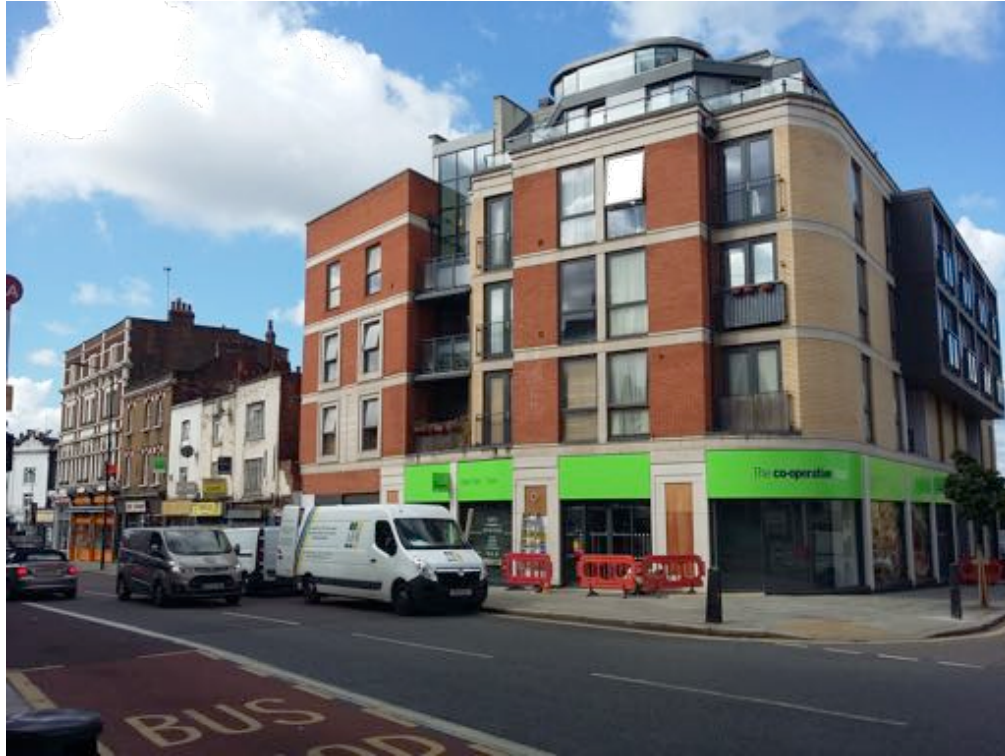
PH1 - SIDE VIEW OF NUMBERS 9, 7, 5, 3, 1, 1a & 2