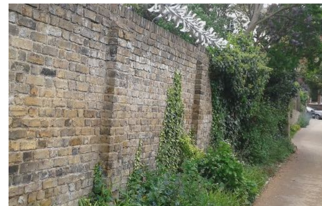
04 Photograph looking East up private drive.