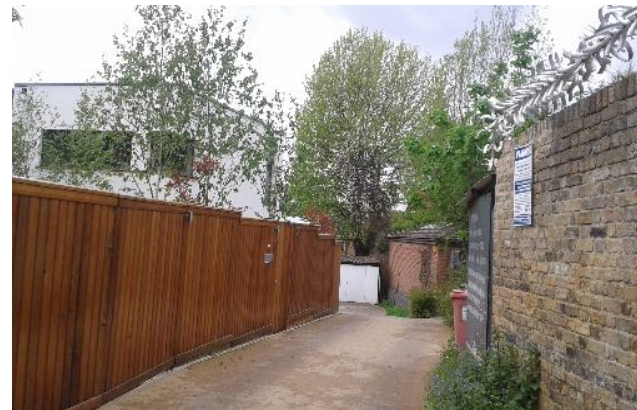
01 Photograph looking West down private drive.