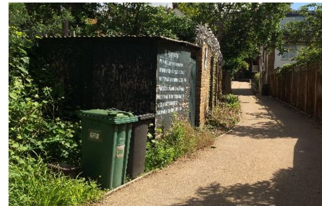
02 Photograph looking East up private drive.