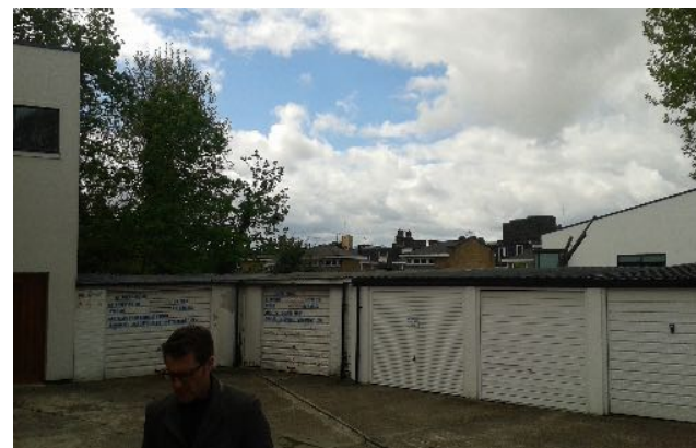
03 Photograph looking West at Garages.