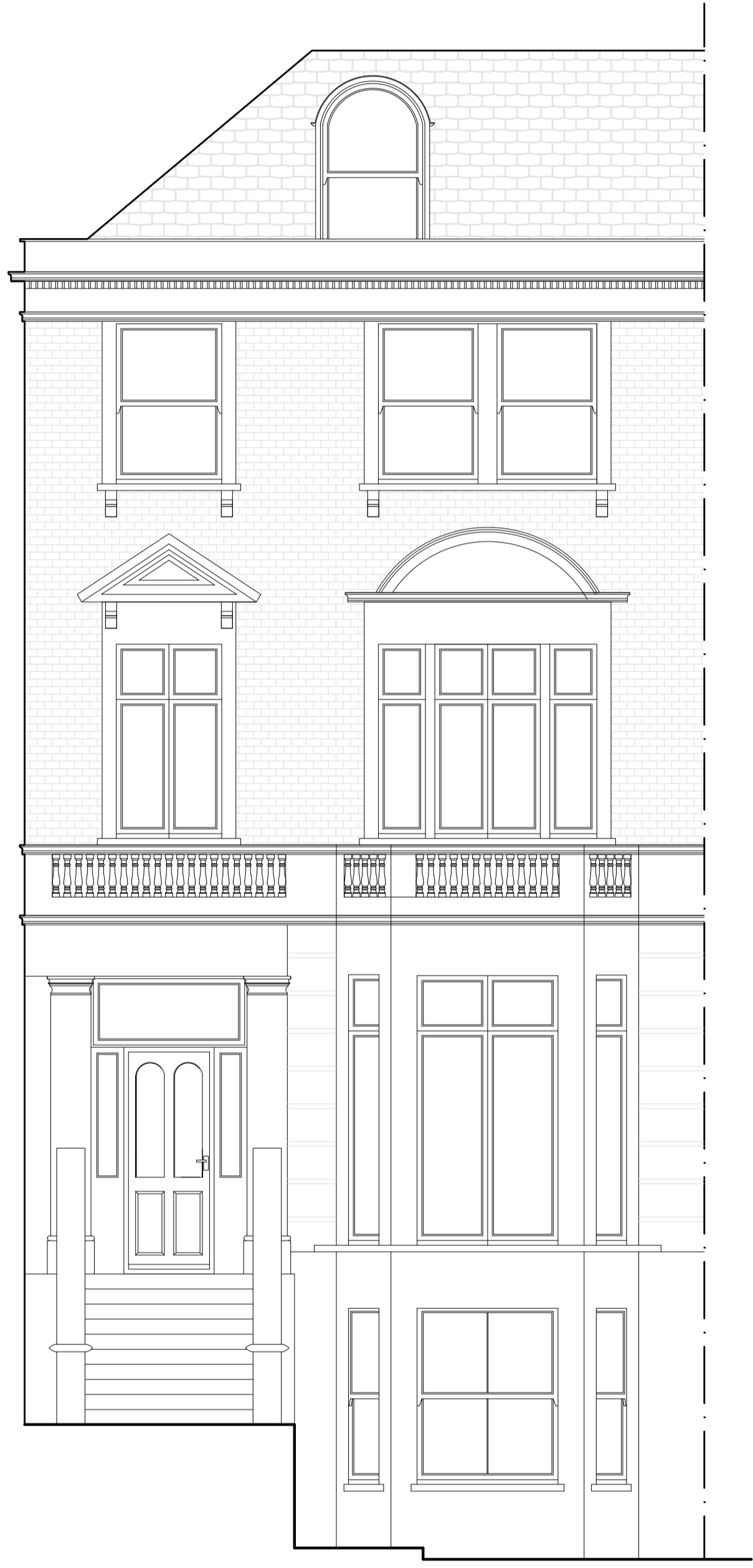
ST 01 EXISTING FRONT ELEVATION 01 SCALE 1:50 @ A1