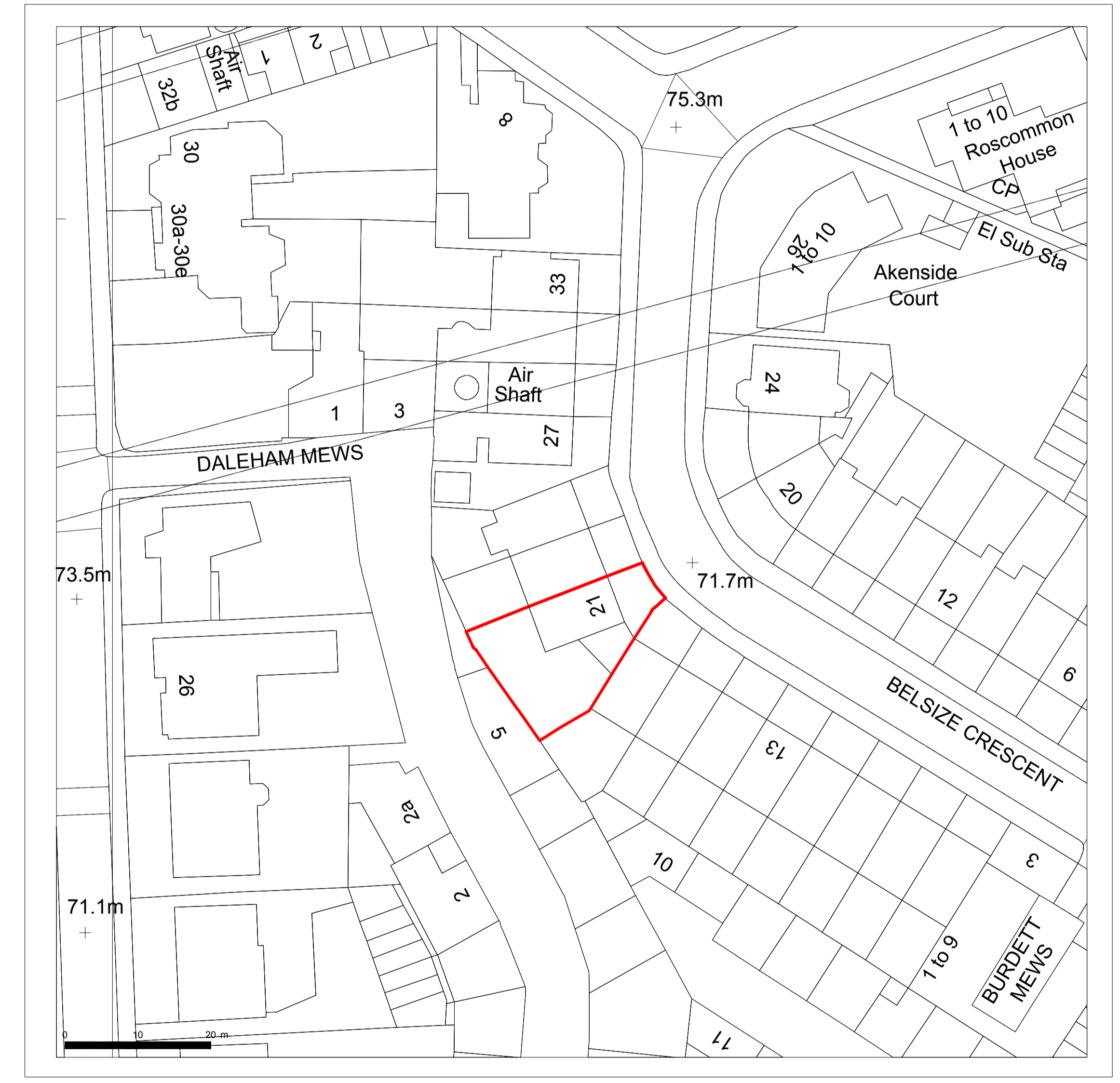
ST 01 SITE PLAN 04 SCALE 1:500 @ A1