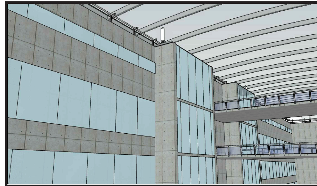
VIEW TO FRONT OF SECTOR 2 (NOT TO SCALE)