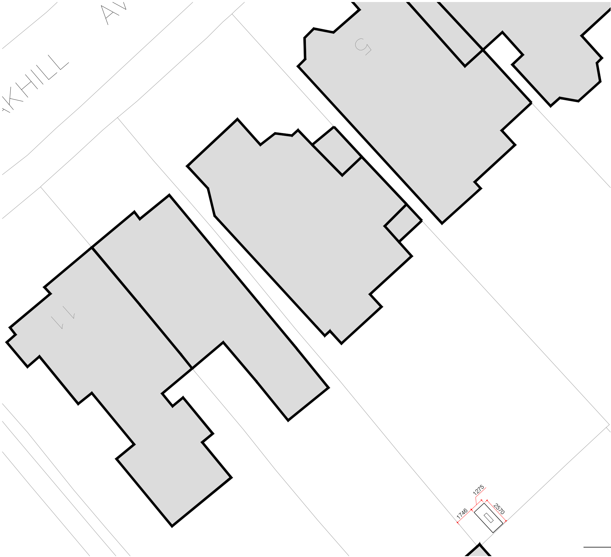
Block Plan 1:200