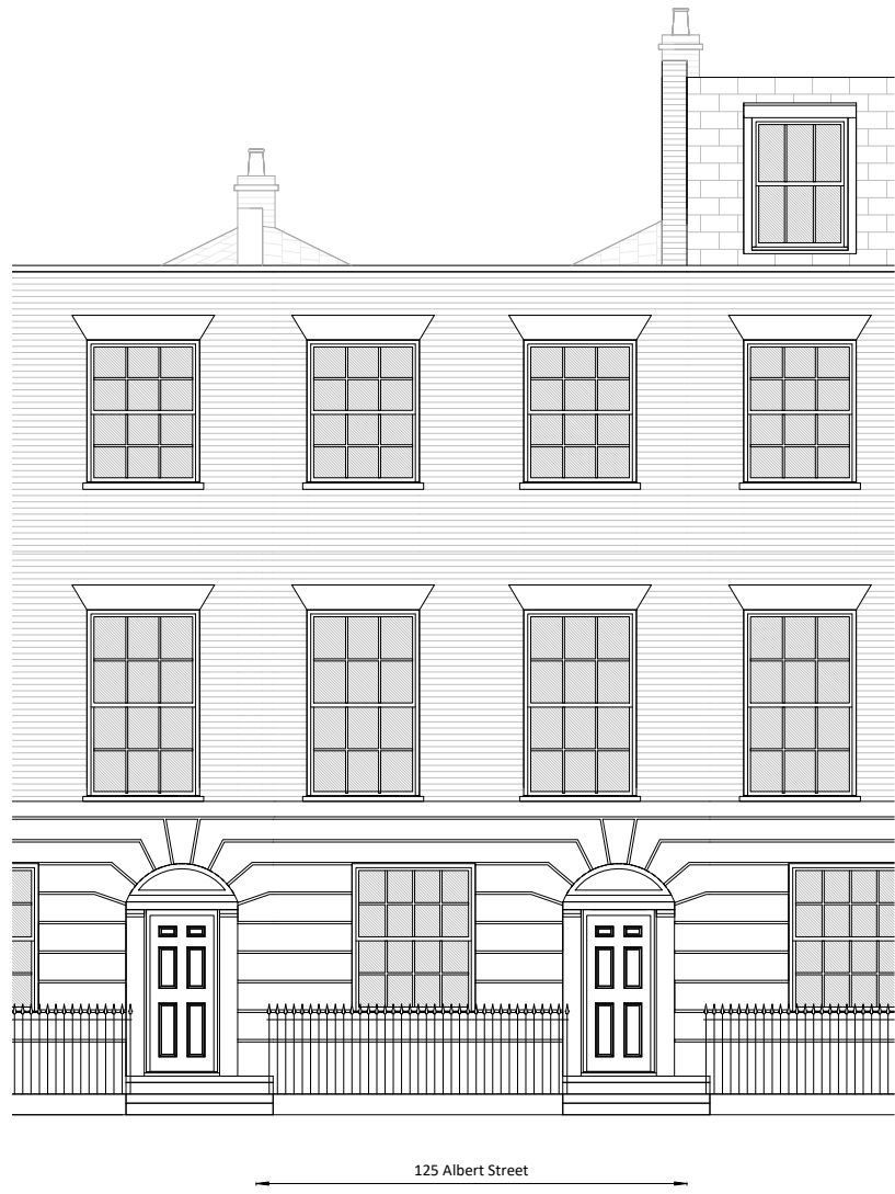
East Elevation 1:50

NOTES This drawing is not to be used for construction purposes.