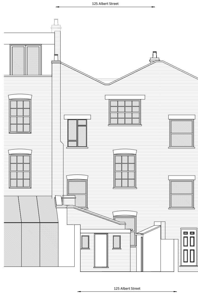
West Elevation 1:50