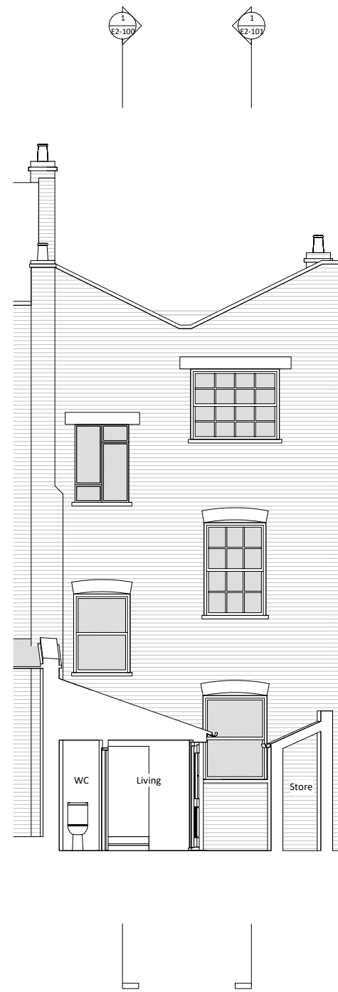
Section 4 1:50