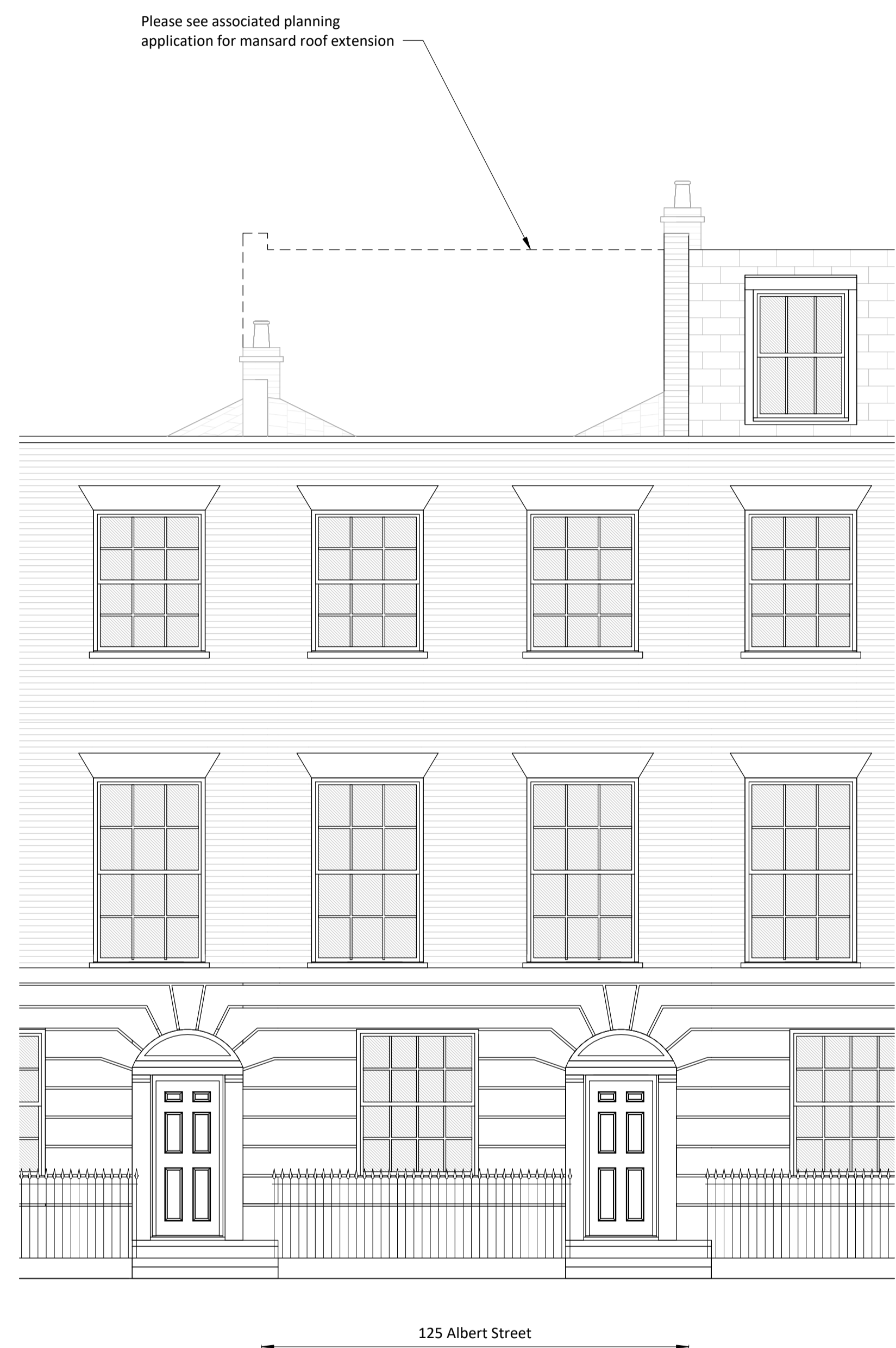
East Elevation 1:50

This drawing is not to be used for construction purposes.