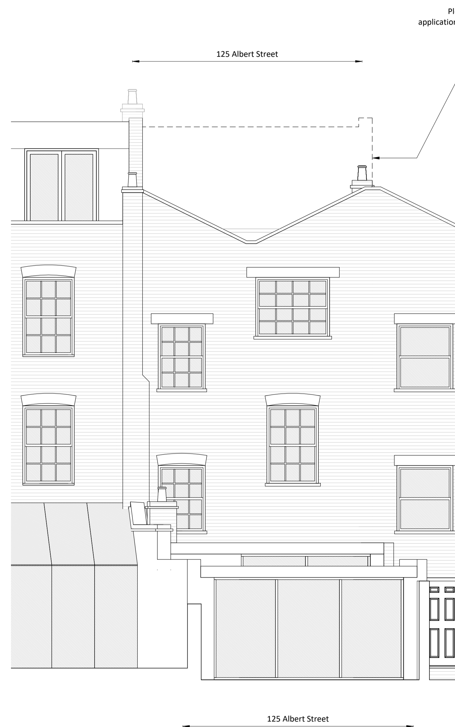
West Elevation 1:50