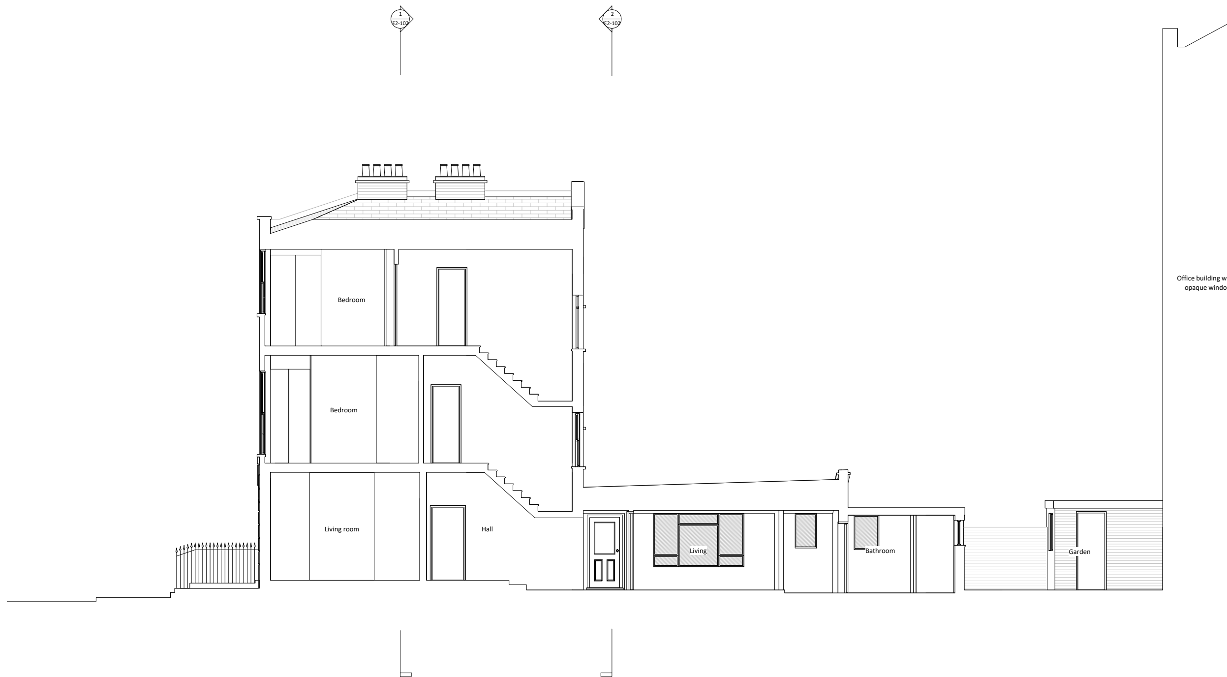
Section 1 1:50

This drawing is not to be used for construction purposes.