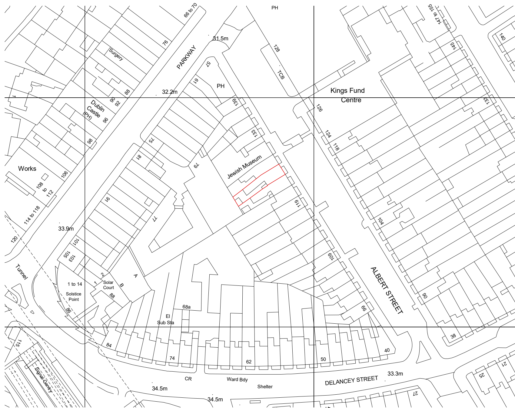
2 Site Plan 1 : 500