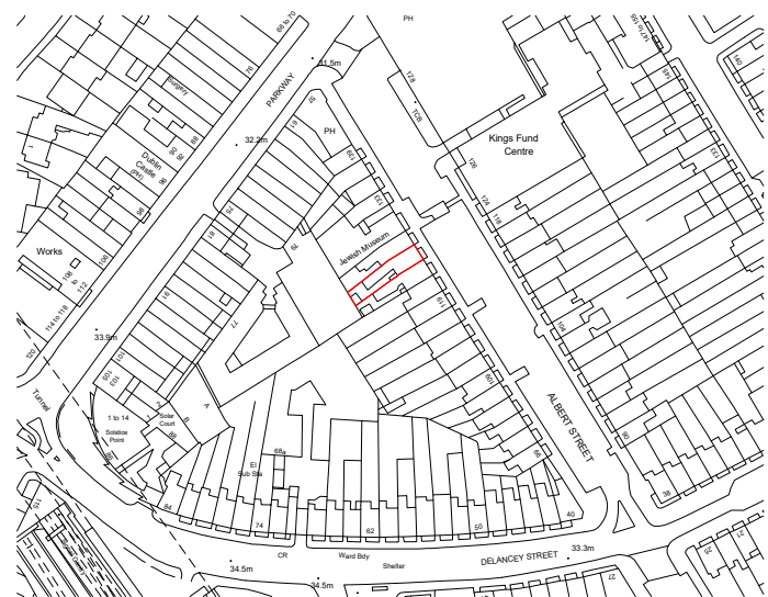
1 Location Plan 1 : 1250

This drawing is not to be used for construction purposes.