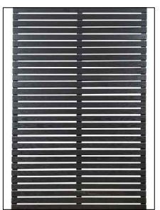
proposed privacy screen