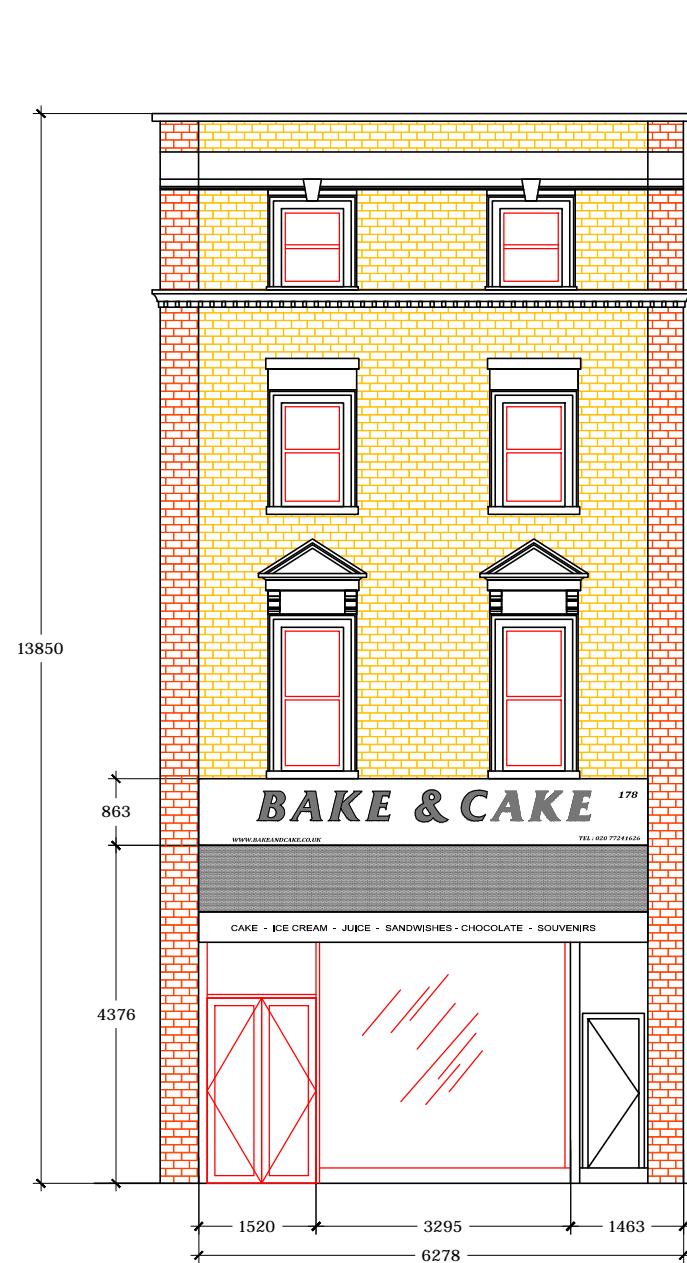
EXISTING MAIN FRONT ELEVATION