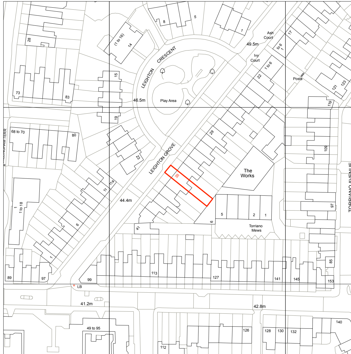
1 Site Location Plan Scale 1:1250 @ A3