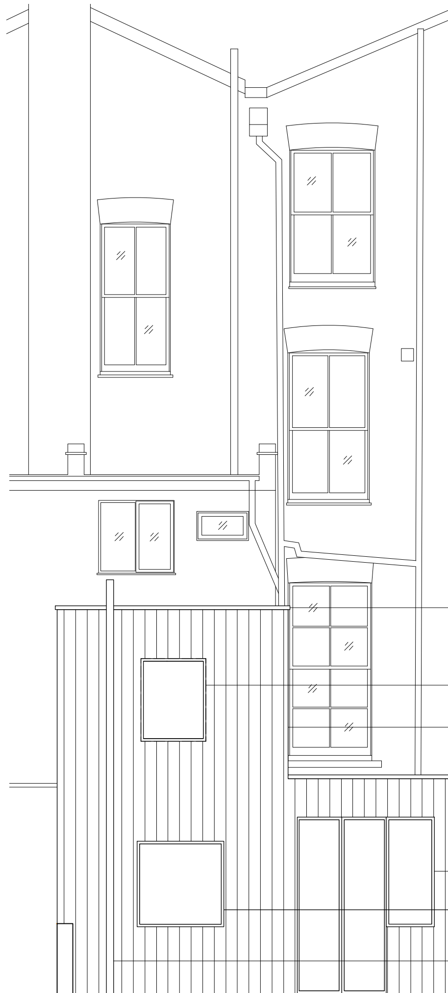
2 Proposed Rear Elevation Scale 1:50 @ A3