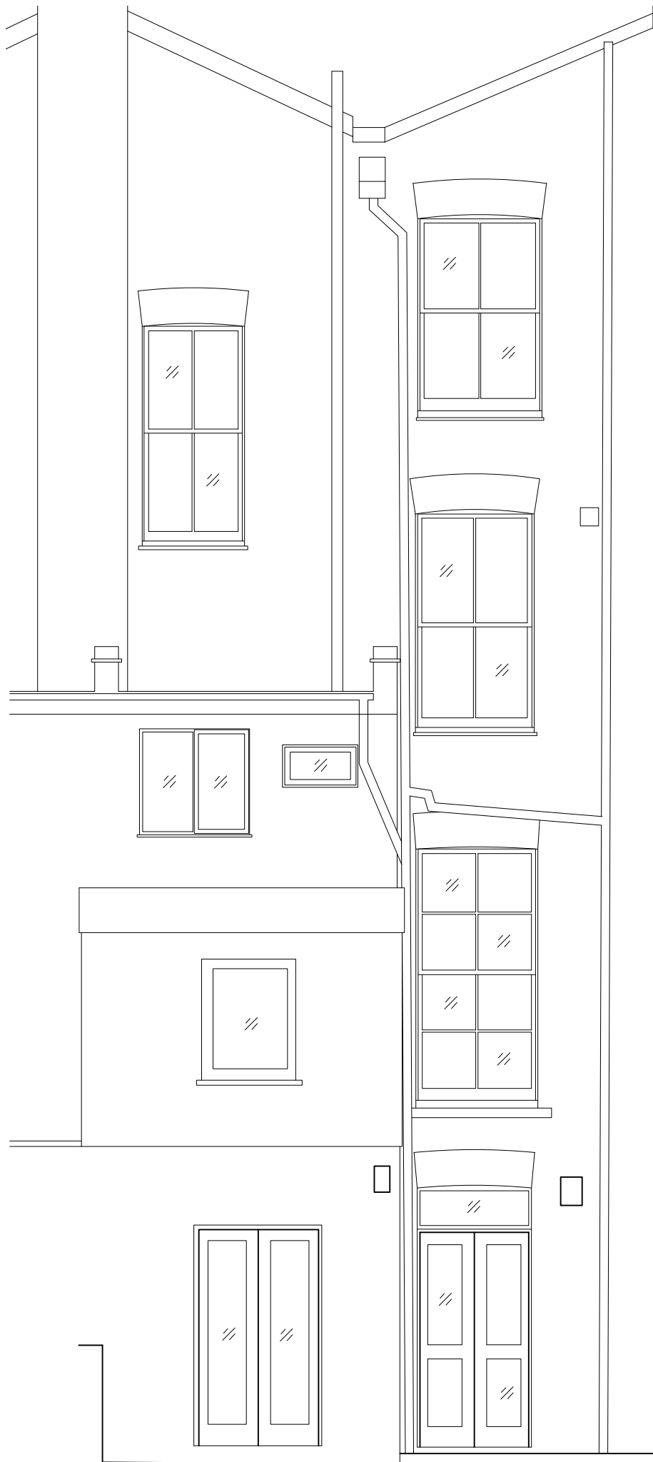
1 Existing Rear Elevation Scale 1:50 @ A3