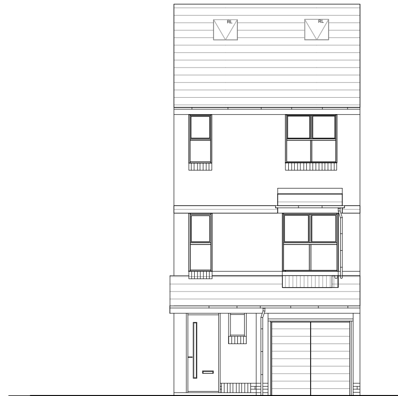
Proposed Front Elevation Scale: 1:100