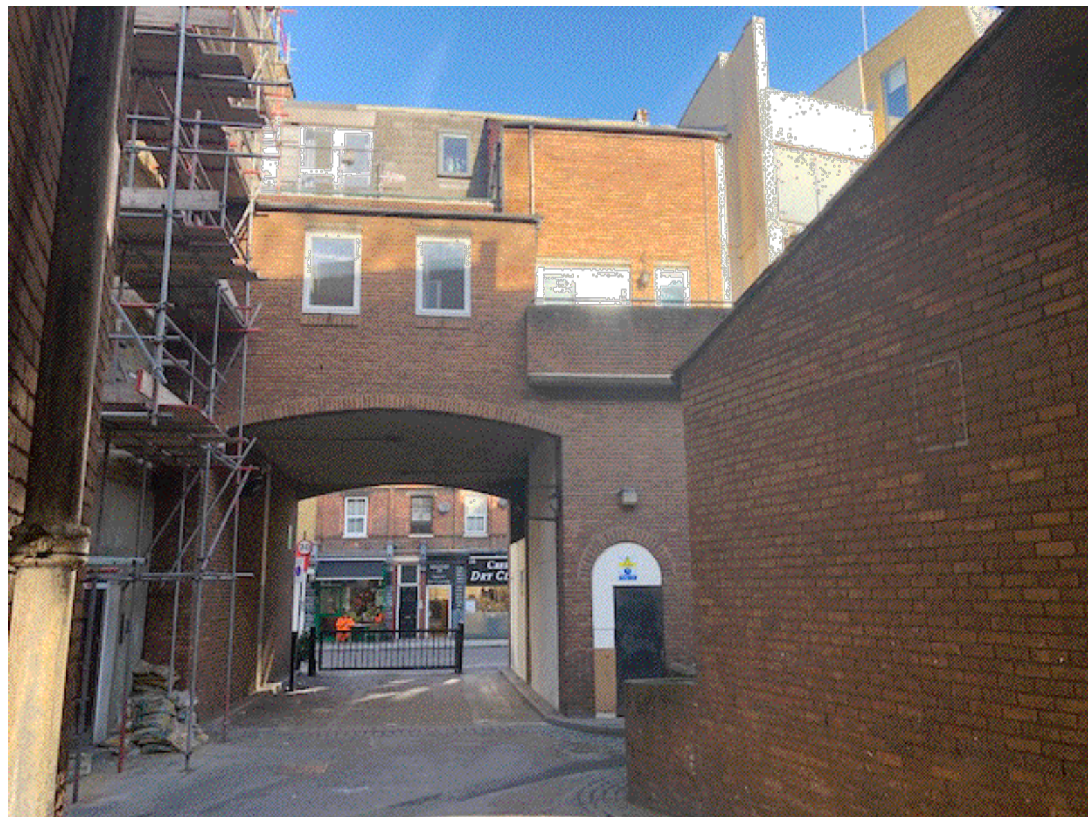
Concrete + brickwork podium - to be retained.