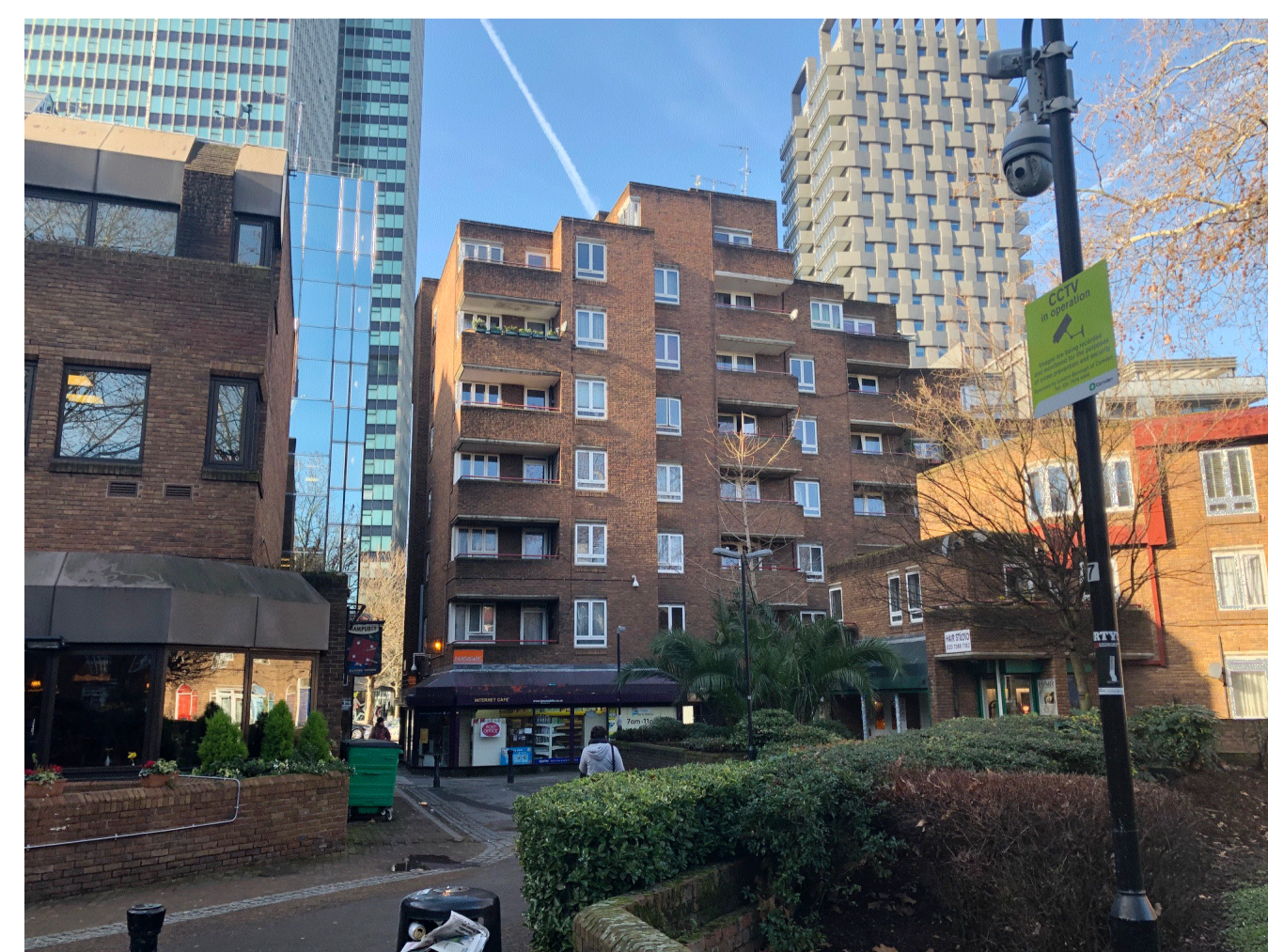
View towards Gateway-D.