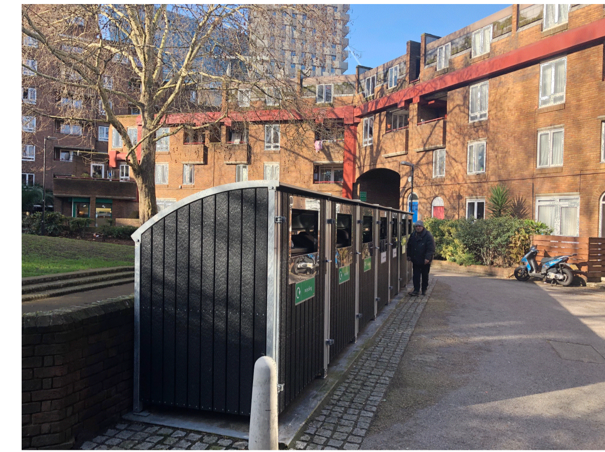
Tolmer's Square - bin store.