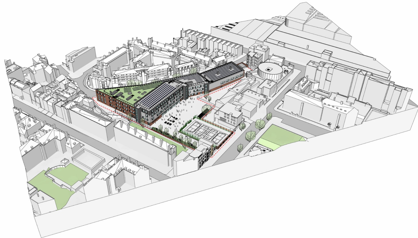
02 NORTH EAST VIEW JW-231 NTS